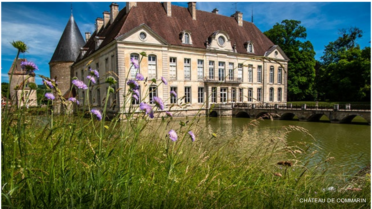
CHÂTEAU DE COMMARIN