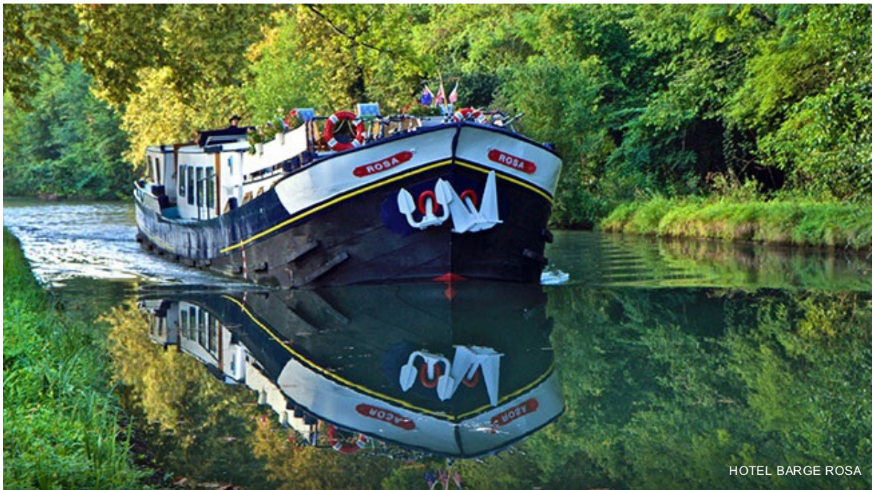
HOTEL BARGE ROSA