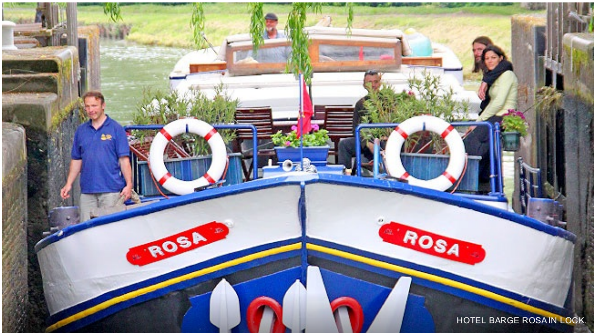
HOTEL BARGE ROSAIN LOCK.