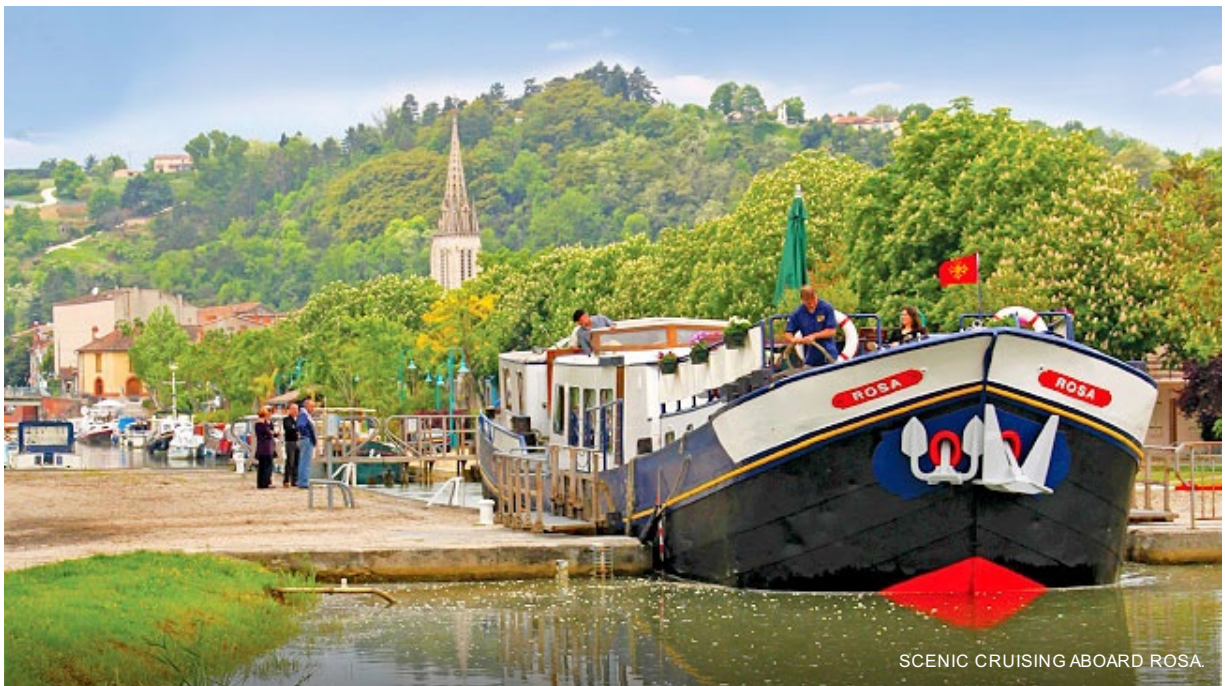
SCENIC CRUISING ABOARD ROSA.