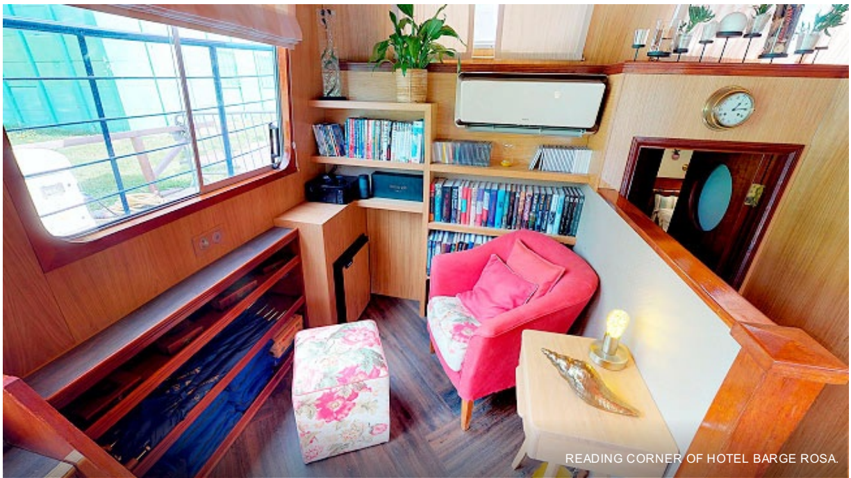
READING CORNER OF HOTEL BARGE ROSA.