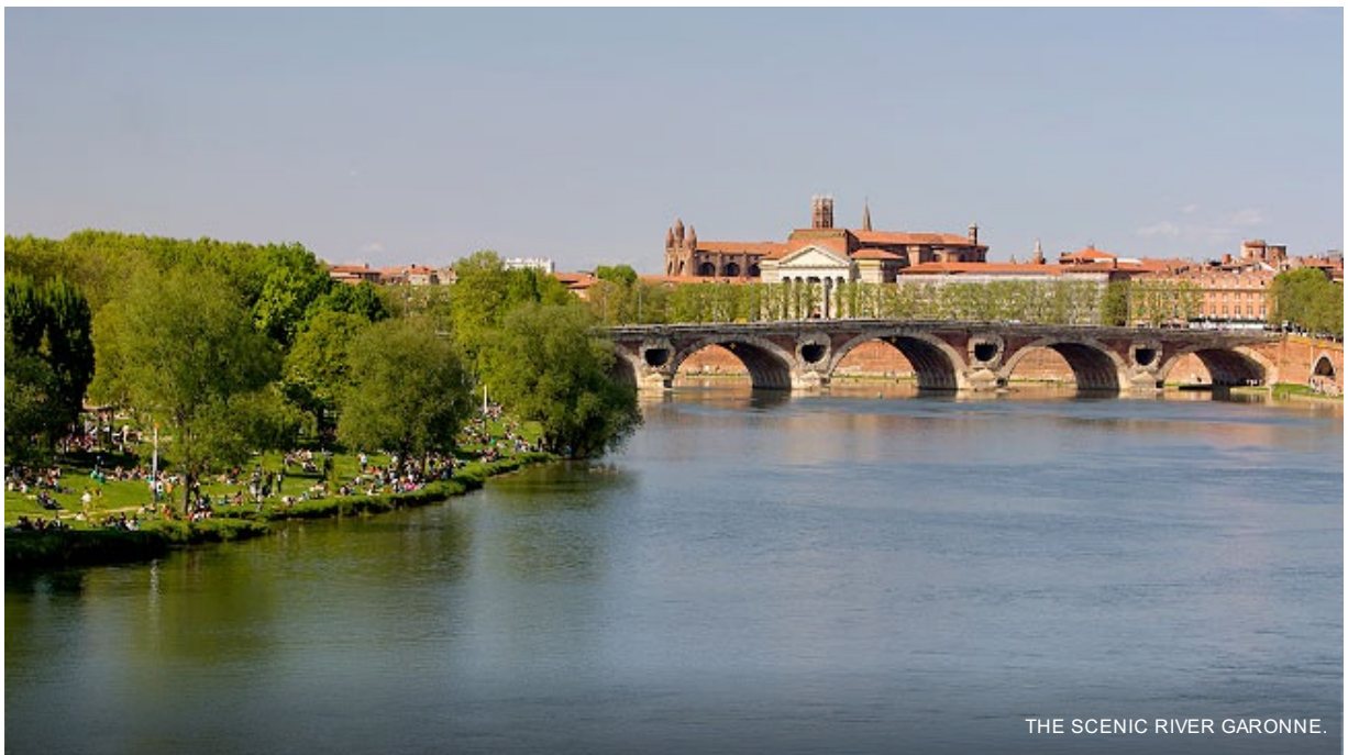
THE SCENIC RIVER GARONNE.