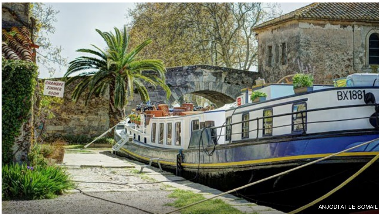
ANJODI AT LE SOMAIL