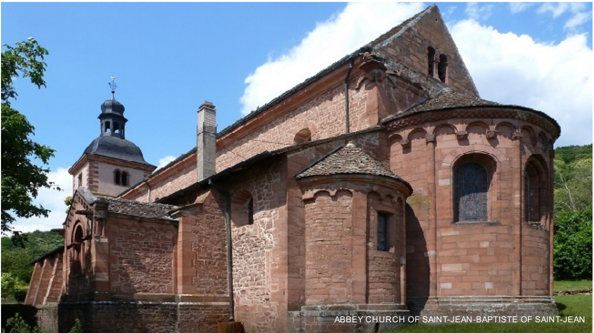
ABBEY CHURCH OF SAINT-JEAN-BAPTISTE OF SAINT-JEAN