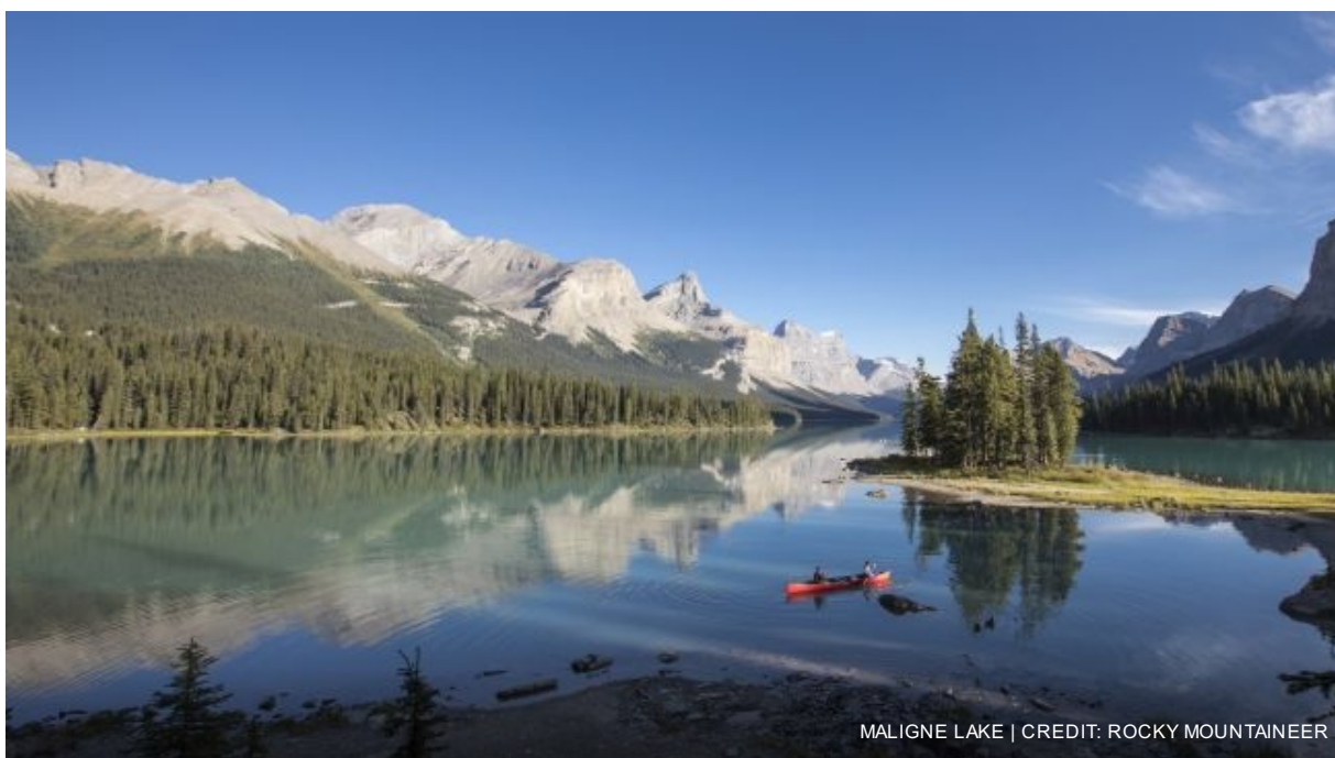
MALIGNE LAKE

Overnight in Jasper at the Chateau Jasper