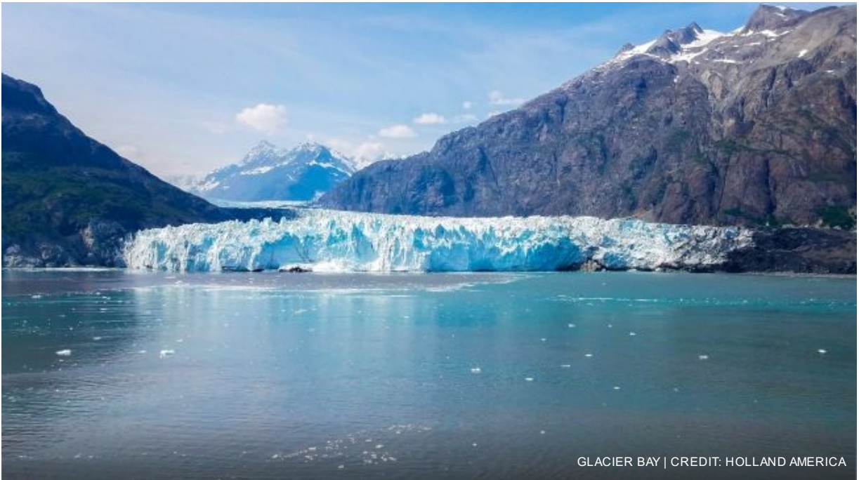
GLACIER BAY