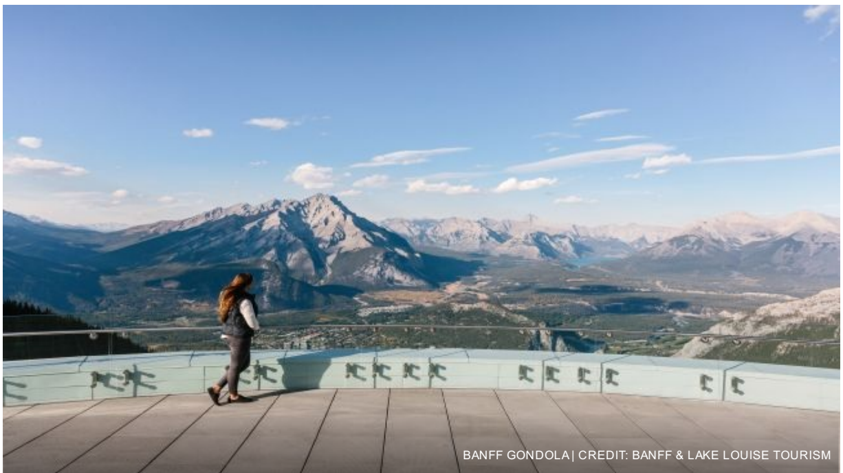
BANFF GONDOLA

Overnight in Calgary at the Delta Calgary Downtown