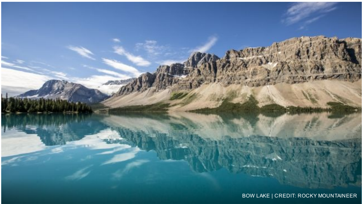
BOW LAKE