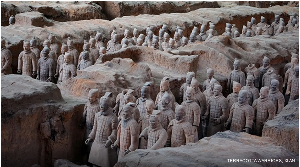
TERRACOTTA WARRIORS, XI AN