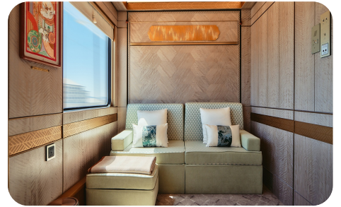
Golden Eagle Silk Road Express