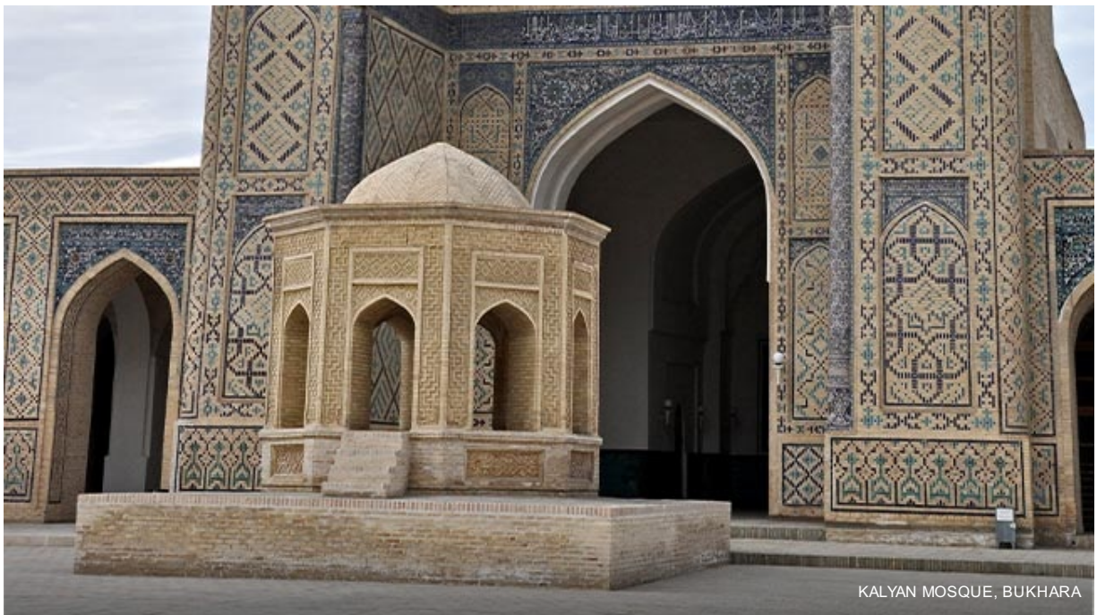
KALYAN MOSQUE, BUKHARA