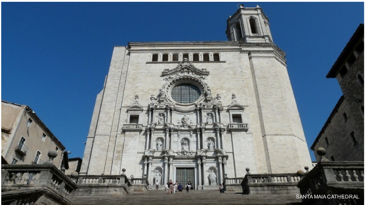
SANTA MAIA CATHEDRAL