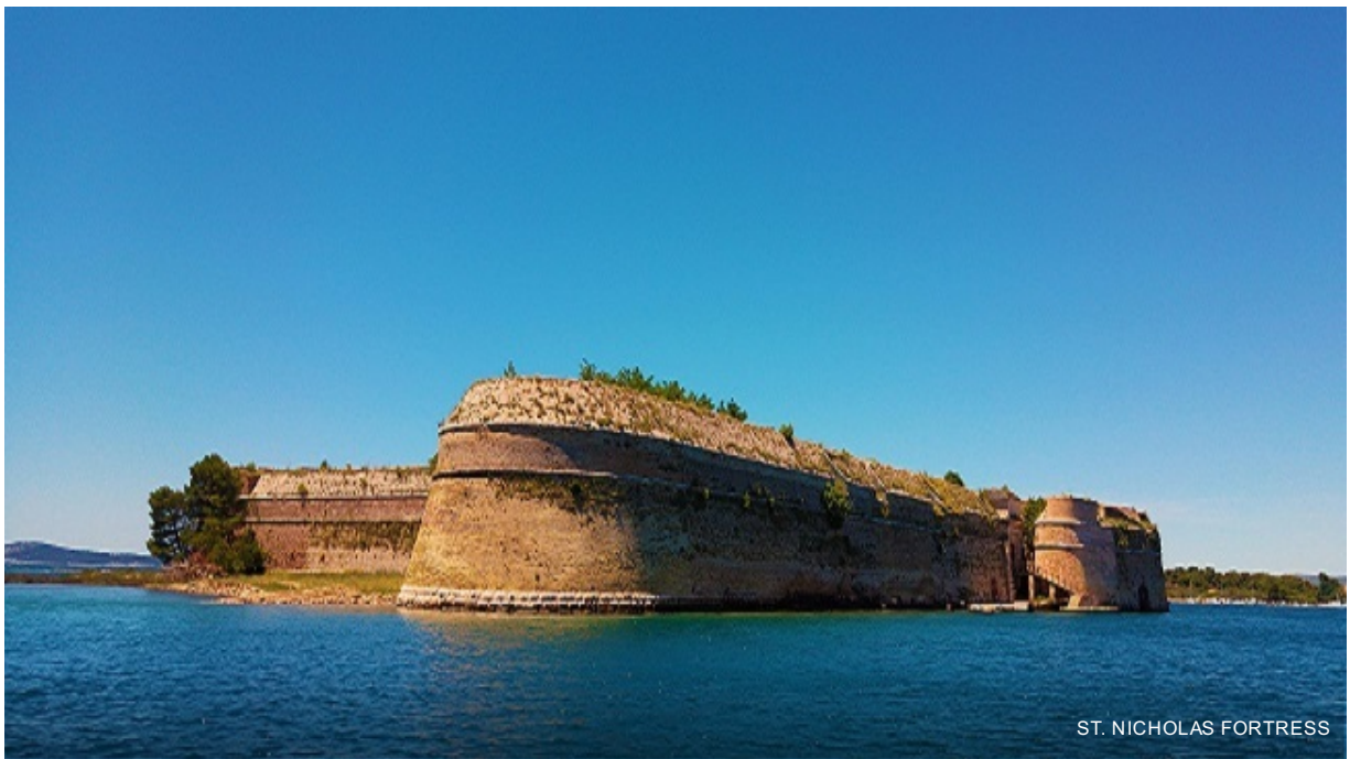
ST. NICHOLAS FORTRESS