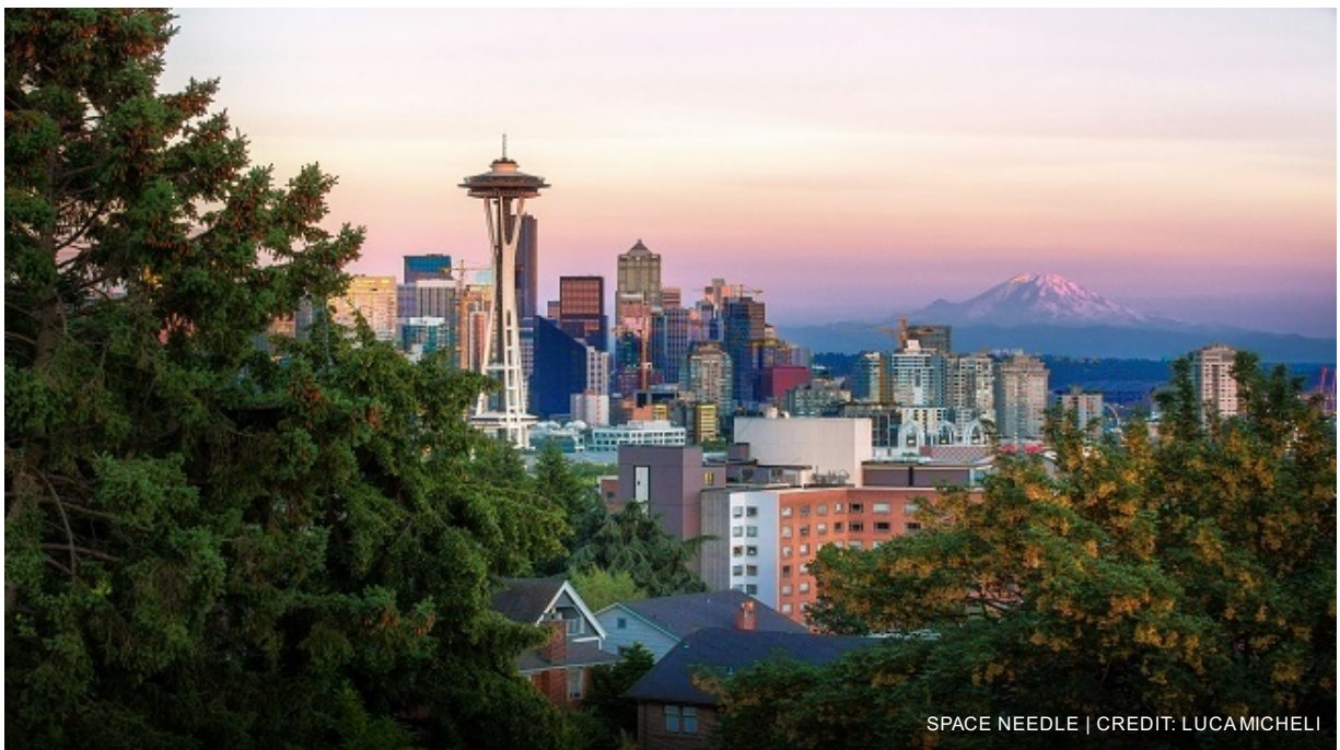
SPACE NEEDLE

Overnight in Seattle at Mayflower Park Hotel