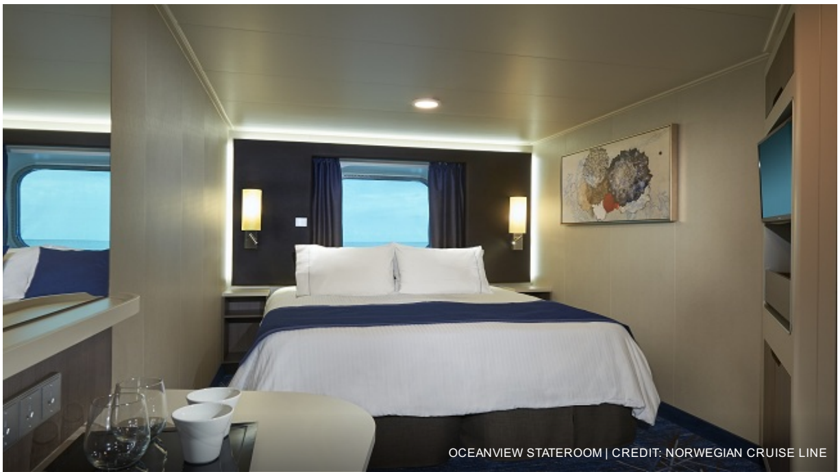
OCEANVIEW STATEROOM