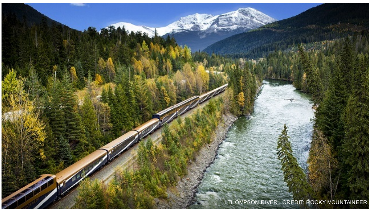
THOMPSON RIVER