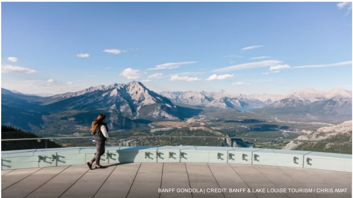
BANFF GONDOLA