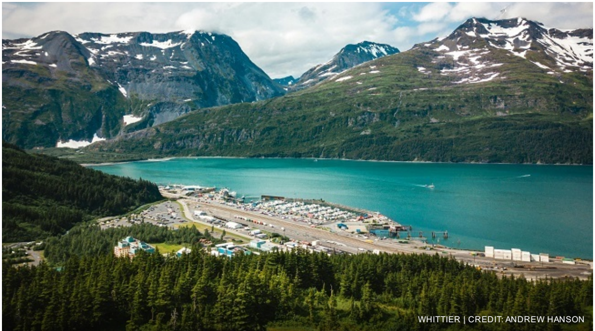
WHITTIER