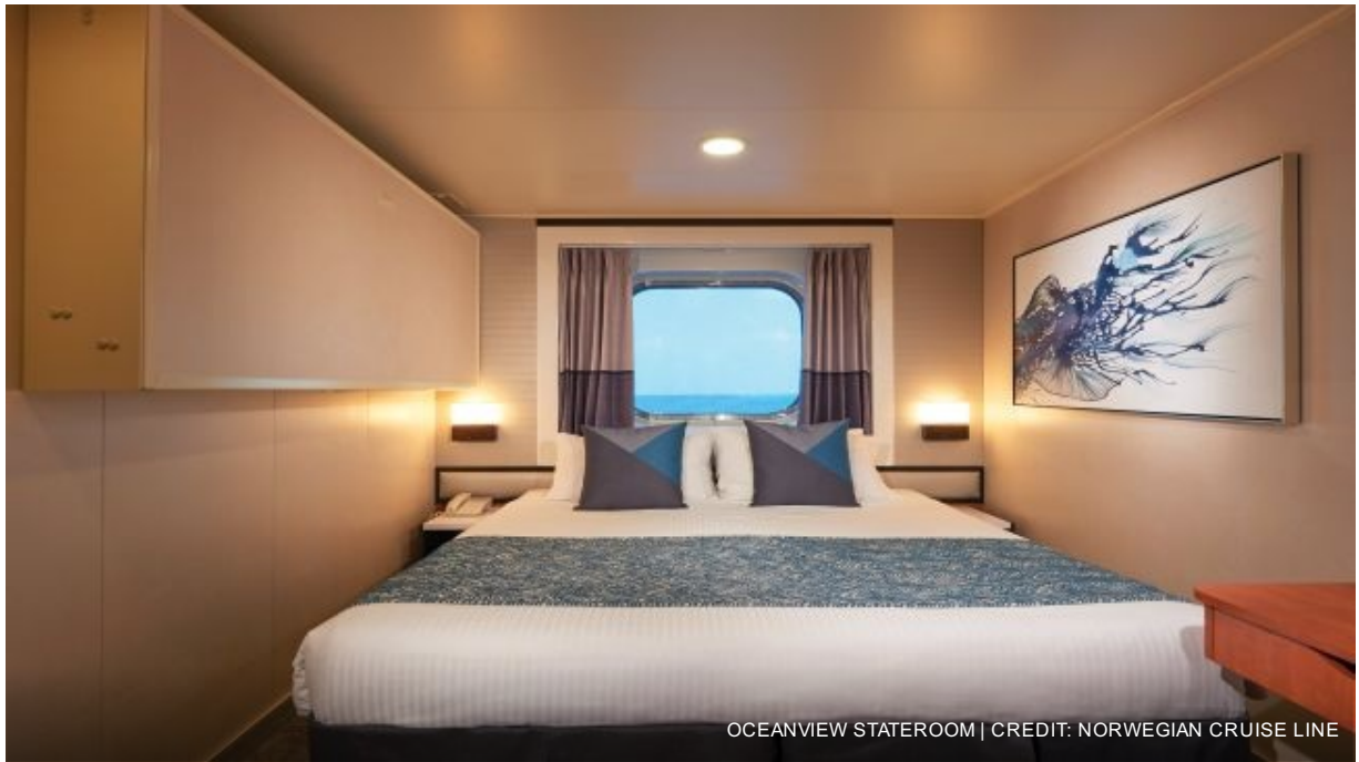
OCEANVIEW STATEROOM