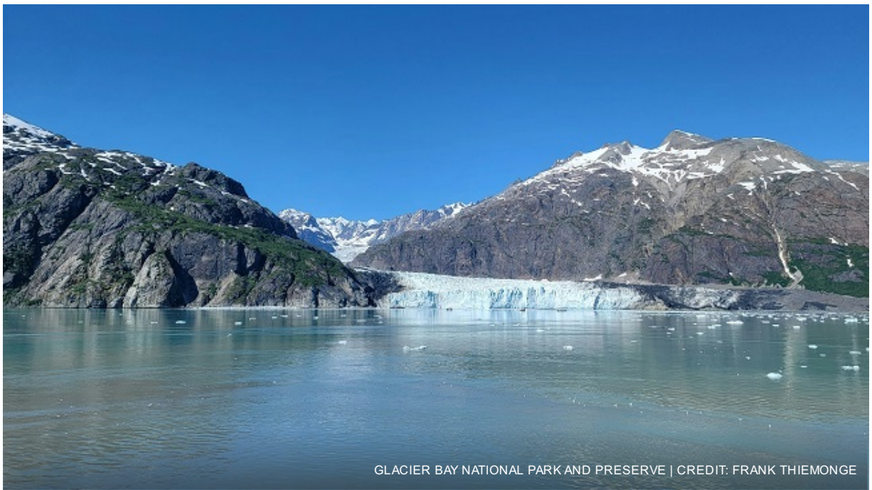
GLACIER BAY NATIONAL PARK AND PRESERVE