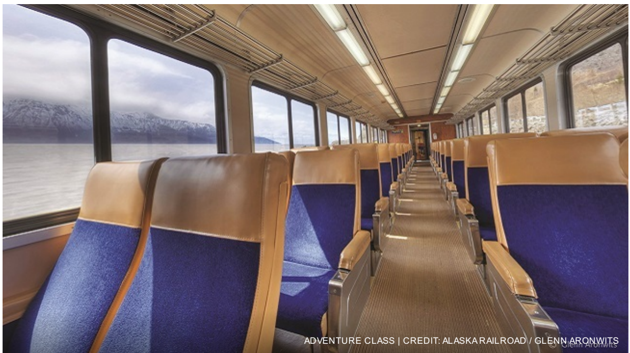
ADVENTURE CLASS

Alaska Railroad's Adventure Class offers a relaxed, scenic journey through Alaska's stunning wilderness. With spacious seats and panoramic windows, you can enjoy breathtaking views of mountains, glaciers, and wildlife. The class provides a casual experience with knowledgeable staff sharing insights about the region's history and culture. It's the perfect way to experience Alaska at a leisurely pace.