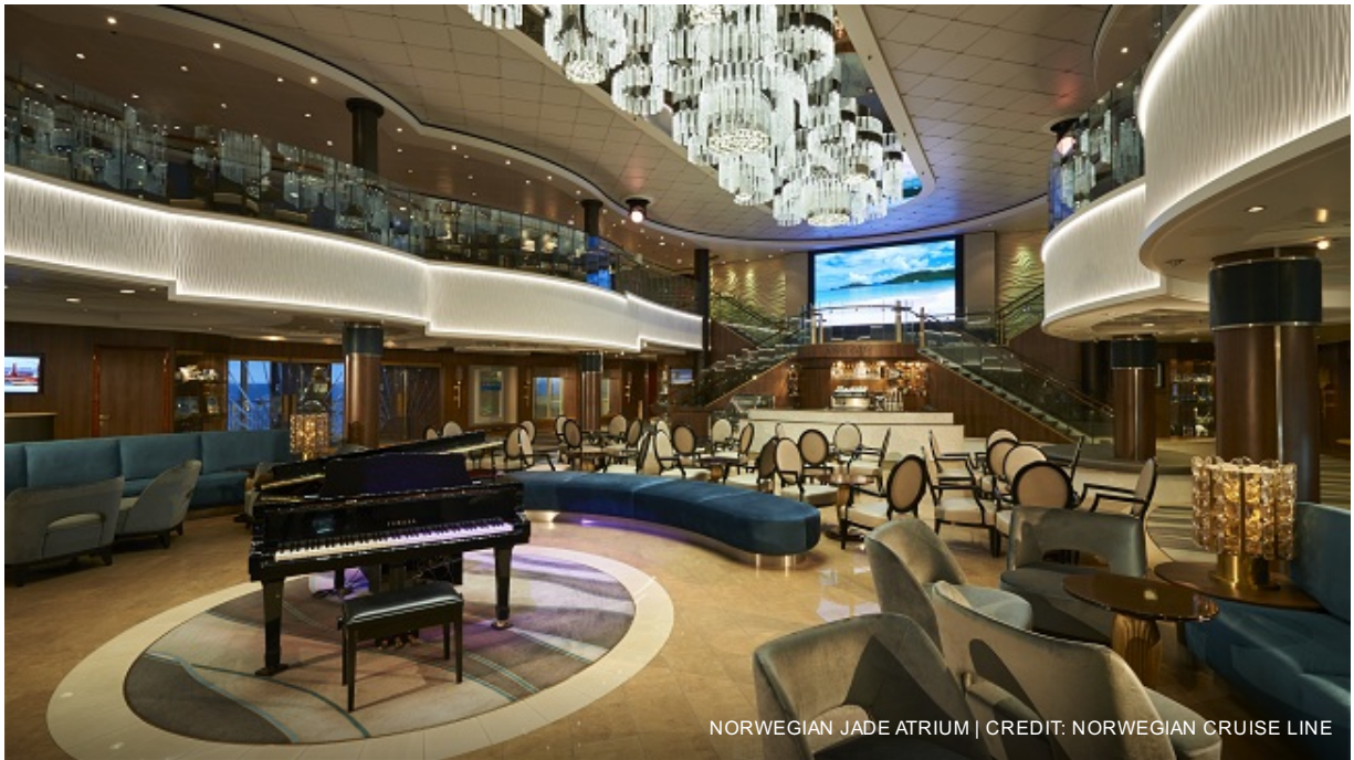
NORWEGIAN JADE ATRIUM