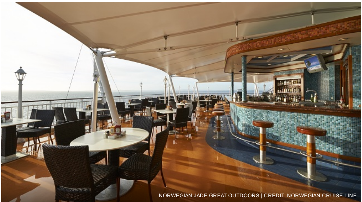
NORWEGIAN JADE GREAT OUTDOORS