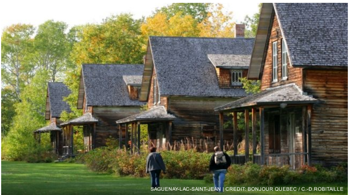
SAGUENAY-LAC-SAINT-JEAN | CREDIT: BONJOUR QUEBEC / C.-D.ROBITAILLE