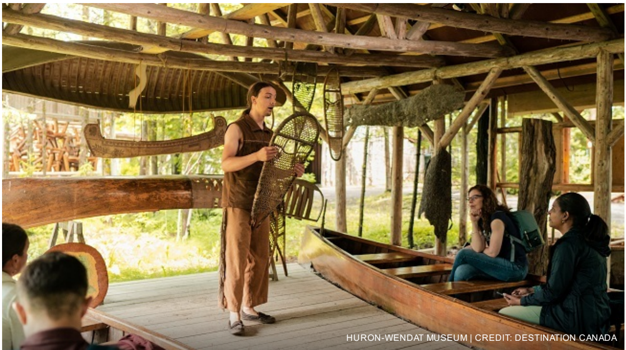
HURON-WENDAT MUSEUM