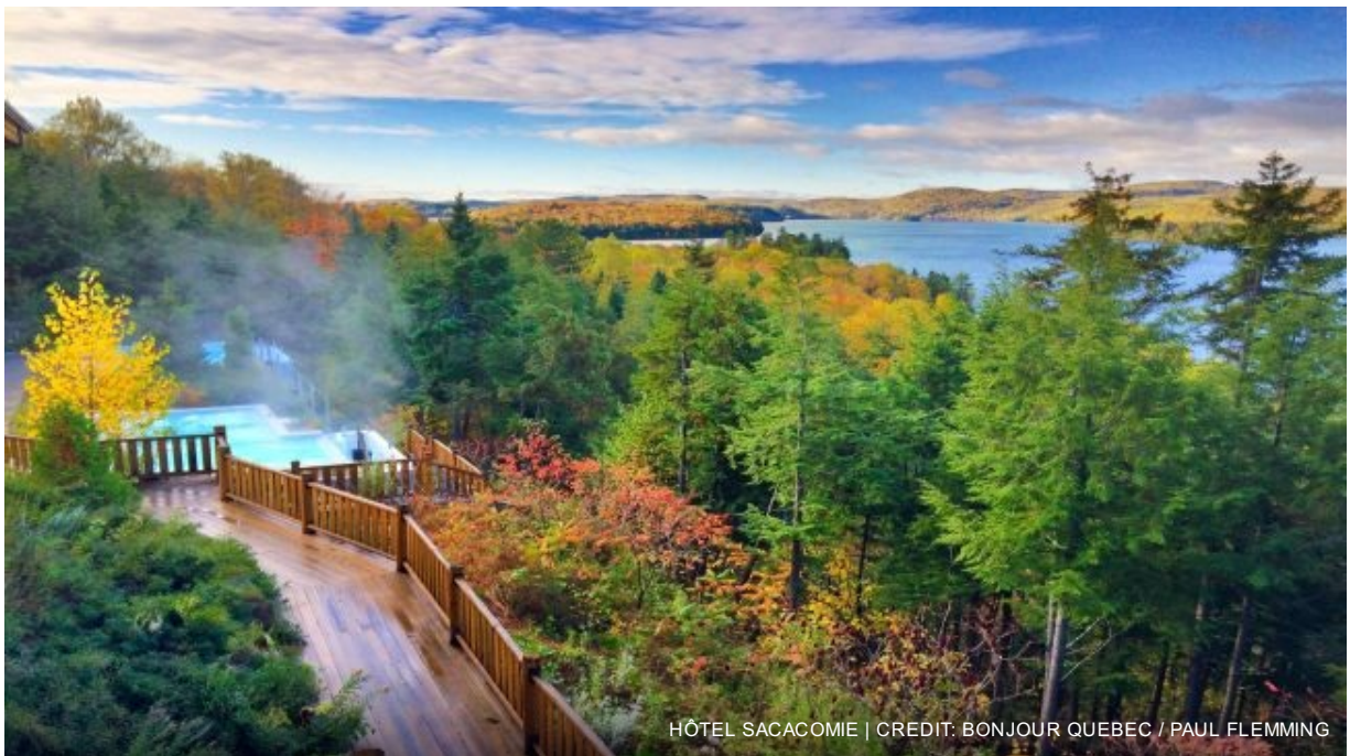
HÔTEL SACACOMIE | CREDIT: BONJOUR QUEBEC / PAUL FLEMMING