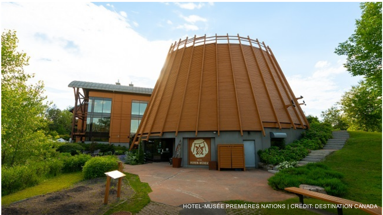
HOTEL-MUSÉE PREMIÈRES NATIONS