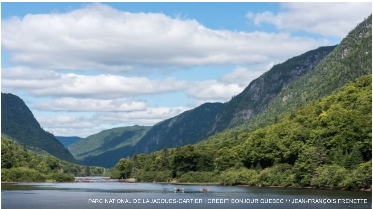
PARC NATIONAL DE LA JACQUES-CARTIER