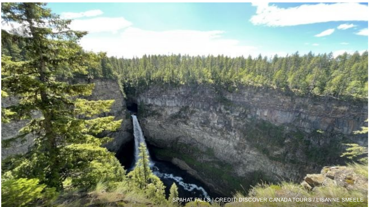
SPAHAT FALLS