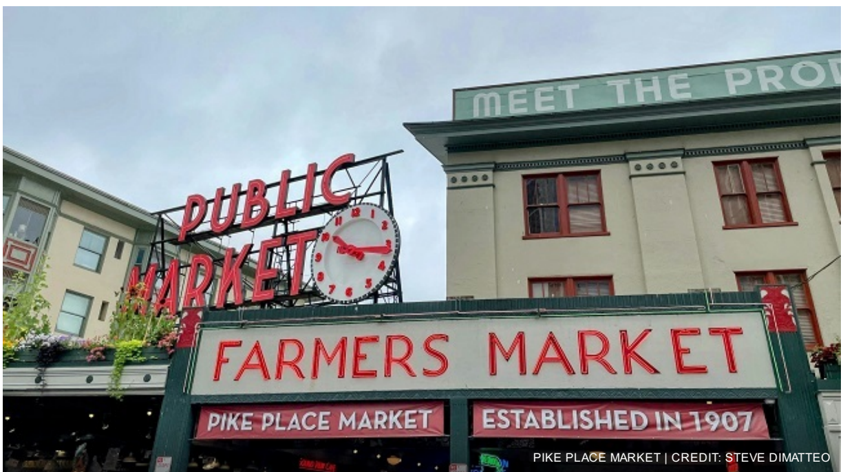
PIKE PLACE MARKET

Overnight in Seattle at Mayflower Park Hotel