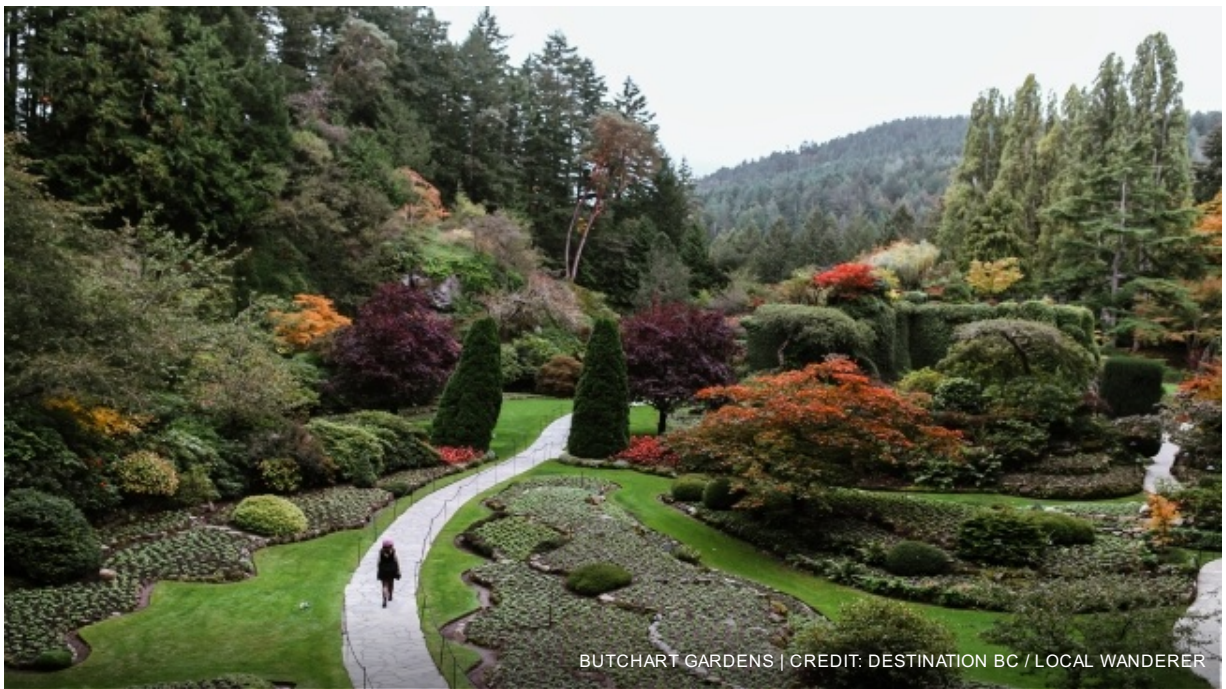
BUTCHART GARDENS