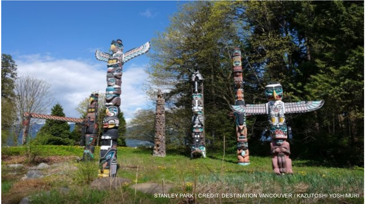
STANLEY PARK