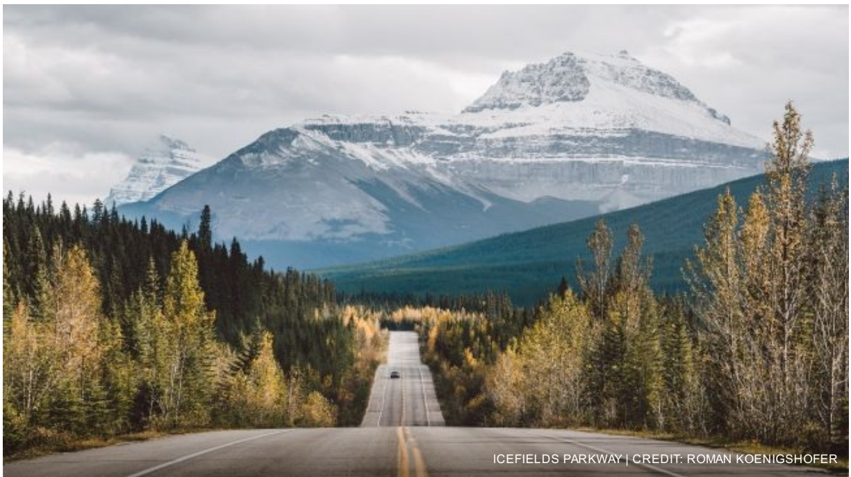
ICEFIELDS PARKWAY