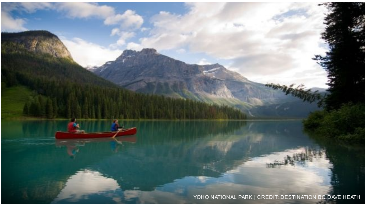
YHO NATIONAL PARK