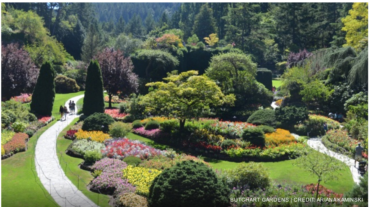
BUTCHART GARDENS