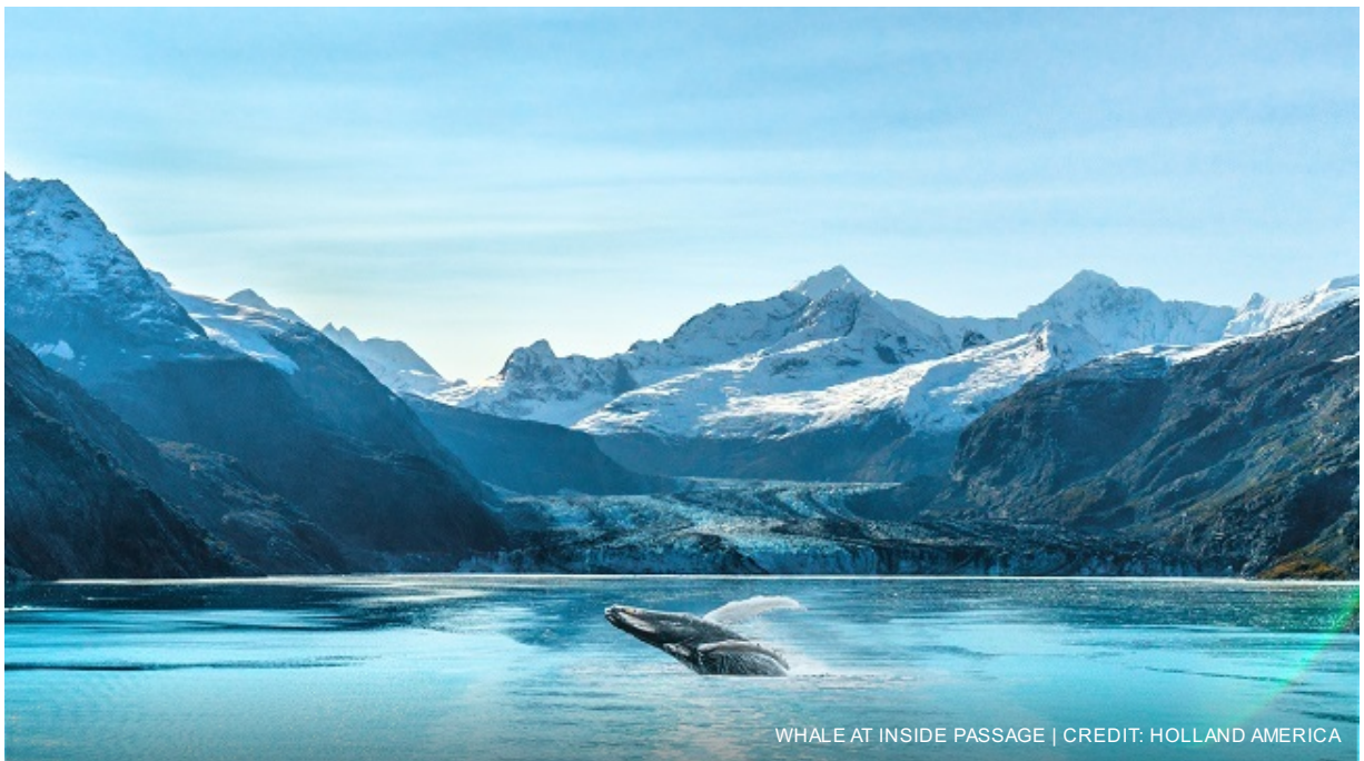
WHALE AT INSIDE PASSAGE