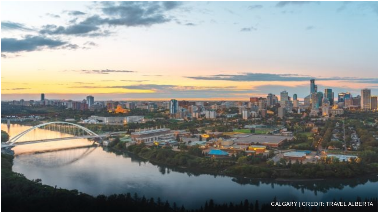
CALGARY

Overnight in Calgary at Delta Hotels by Marriott Calgary Downtown