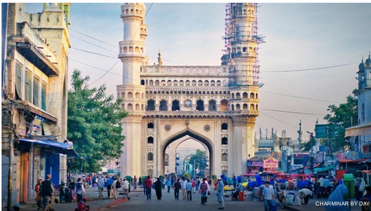
CHARMINAR BY DAY