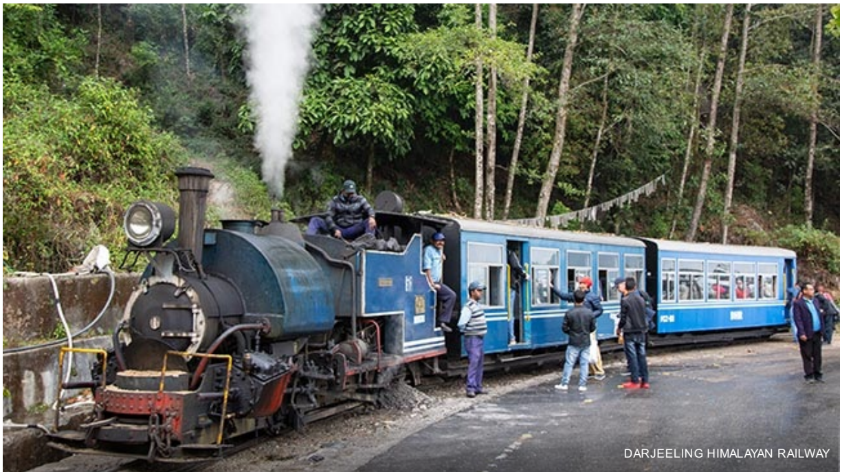
DARJEELING HIMALAYAN RAILWAY