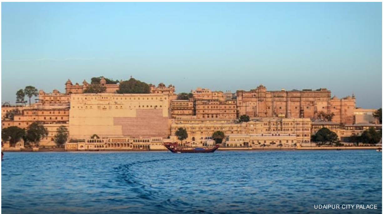
UDAIPUR CITY PALACE