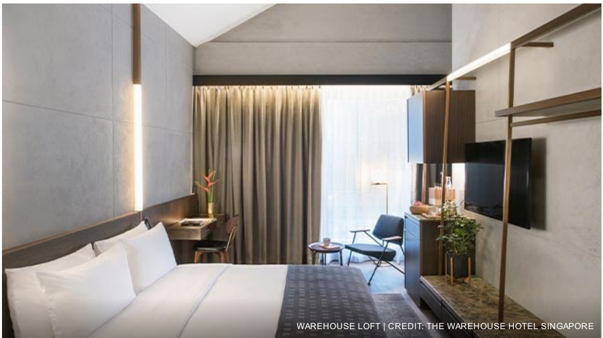
WAREHOUSE LOFT

Overnight stay at The Warehouse Hotel in a Warehouse Loft.