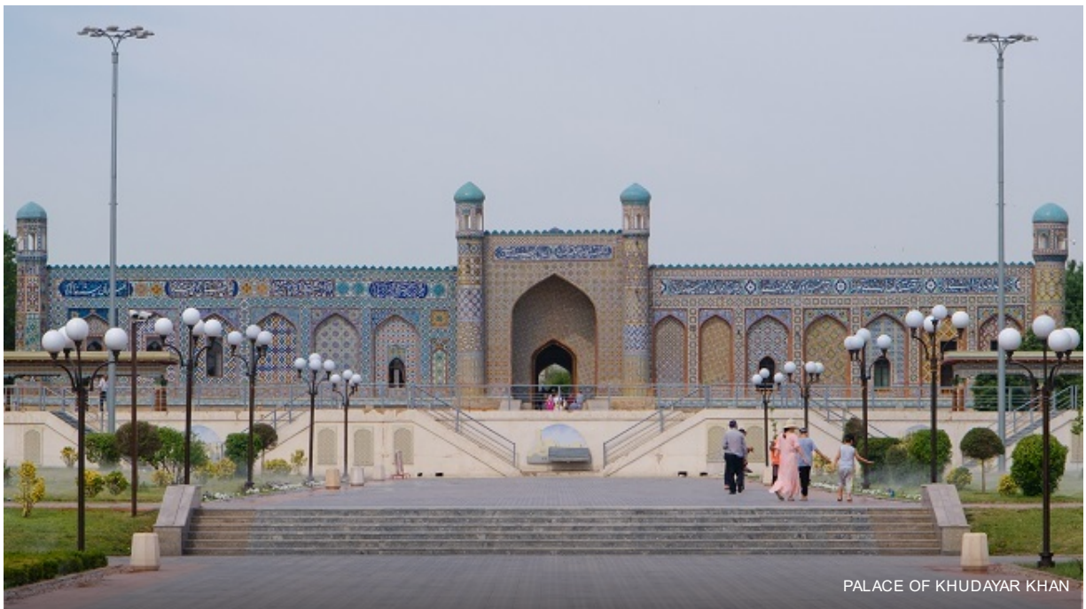
PALACE OF KHUDAYAR KHAN