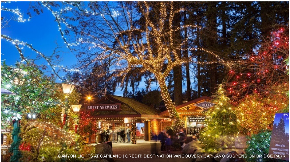
CANYON LIGHTS AT CAPILANO

Overnight in Vancouver at the Sutton Place Hotel