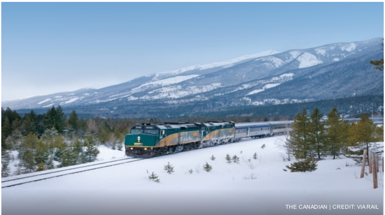
THE CANADIAN