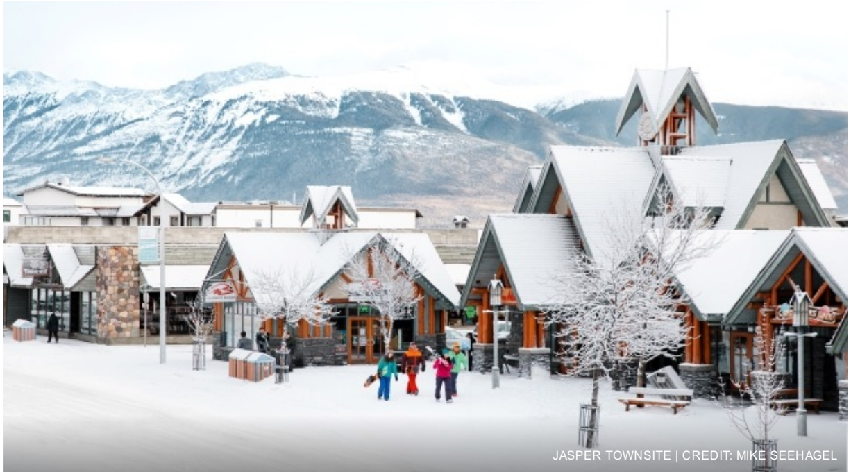
JASPER TOWNSITE