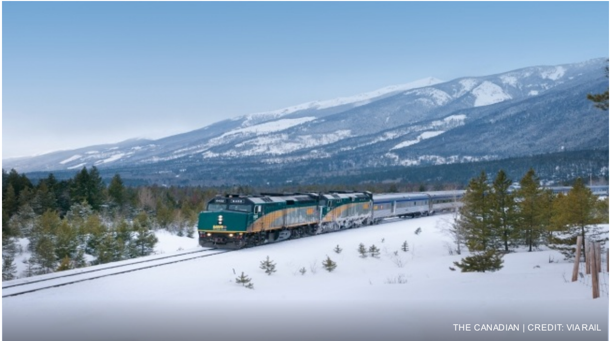
THE CANADIAN