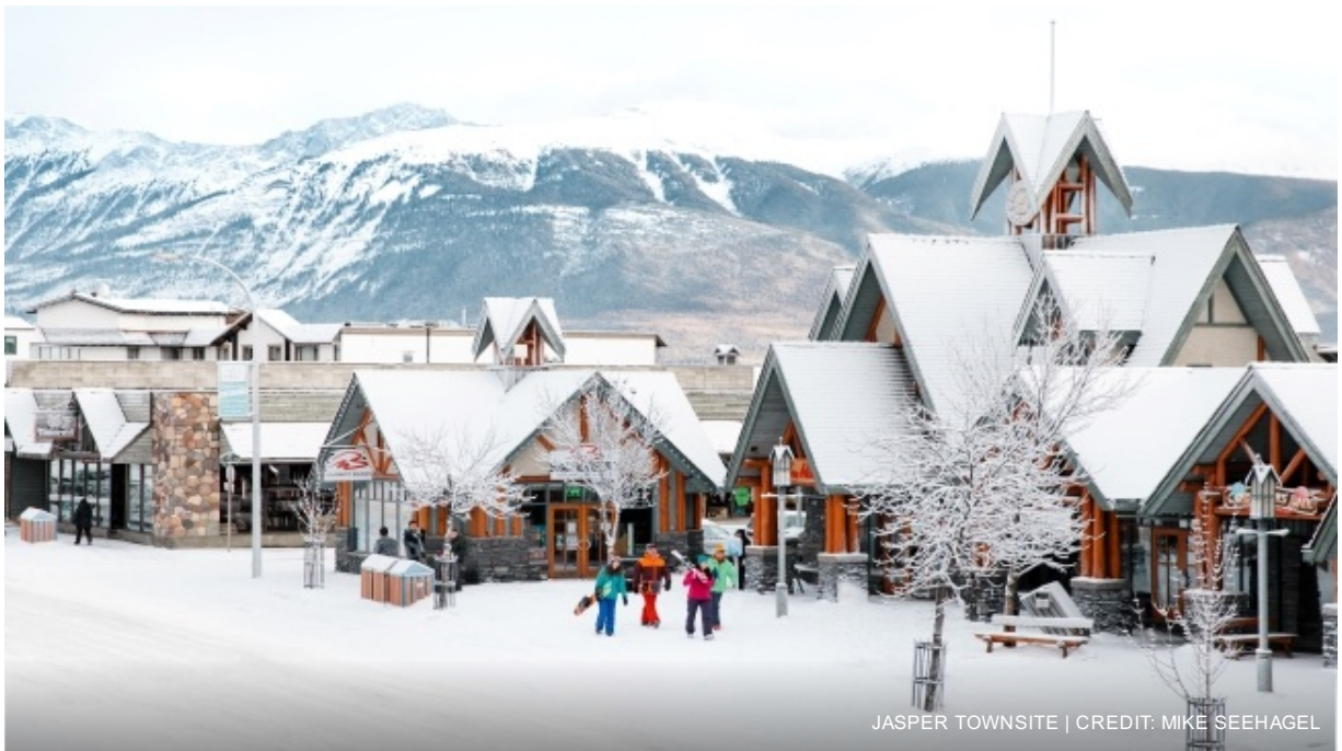
JASPER TOWNSITE

Overnight stay in Jasper at Crimson Jasper Hotel