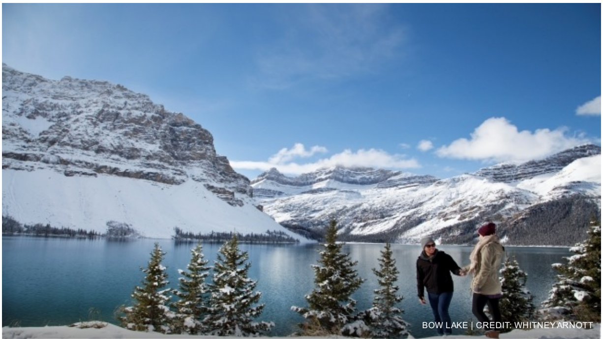
BOW LAKE