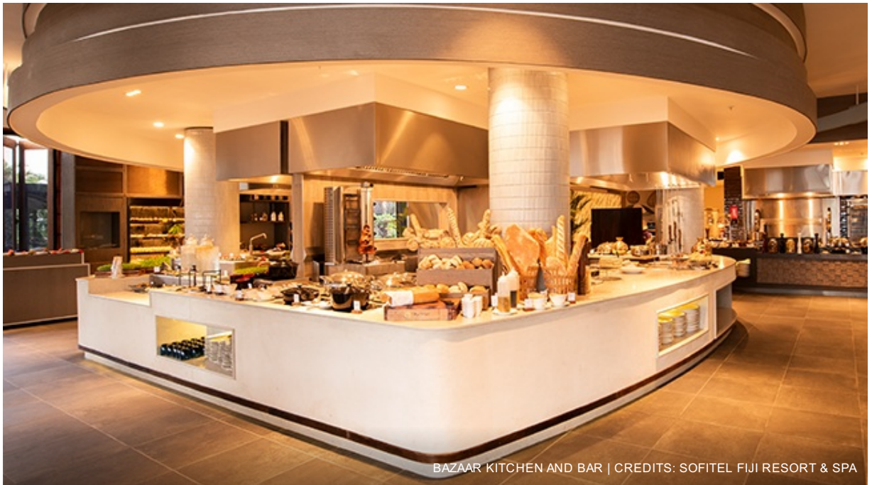
BAZAAR KITCHEN AND BAR