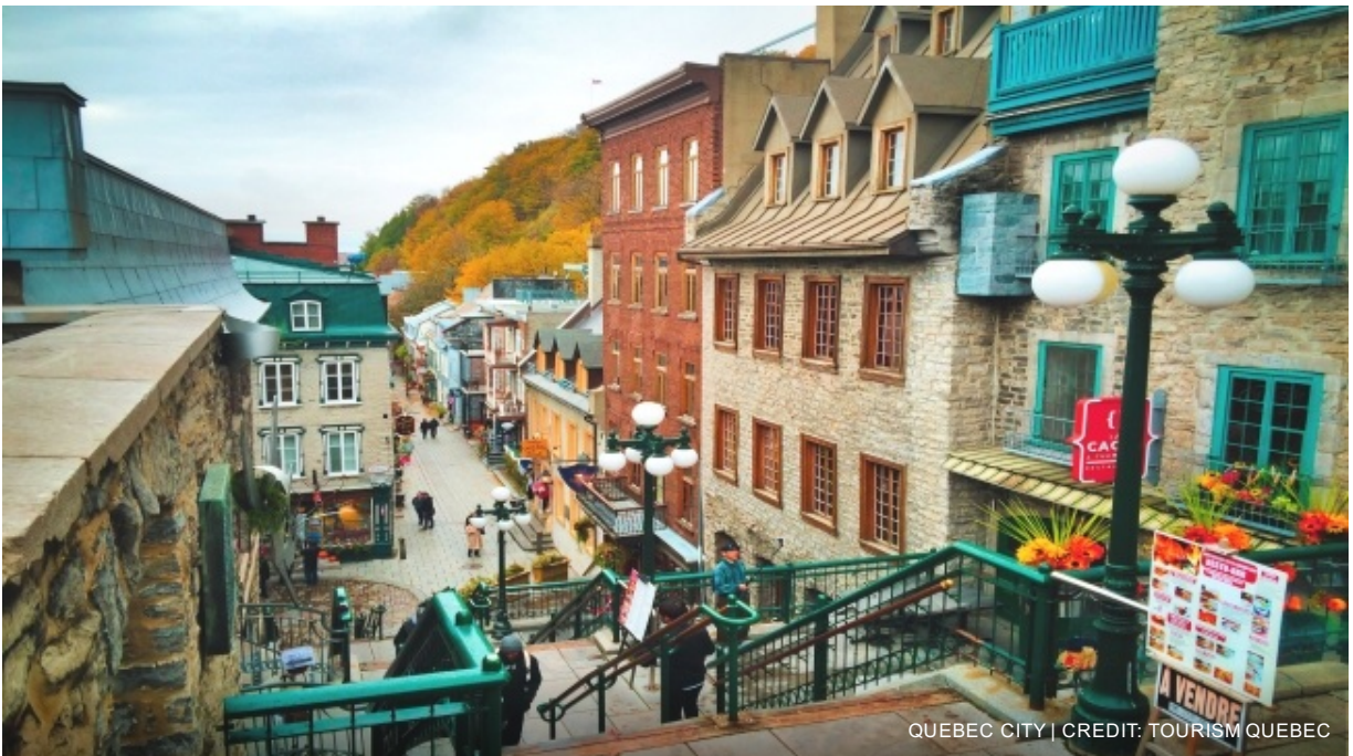
QUEBEC CITY

Overnight in Quebec City at the Hotel Manoir Victoria