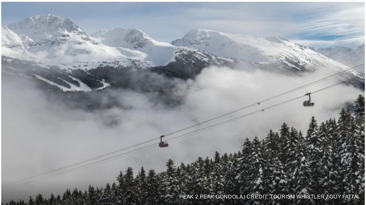
PEAK 2 PEAK GONDOLA