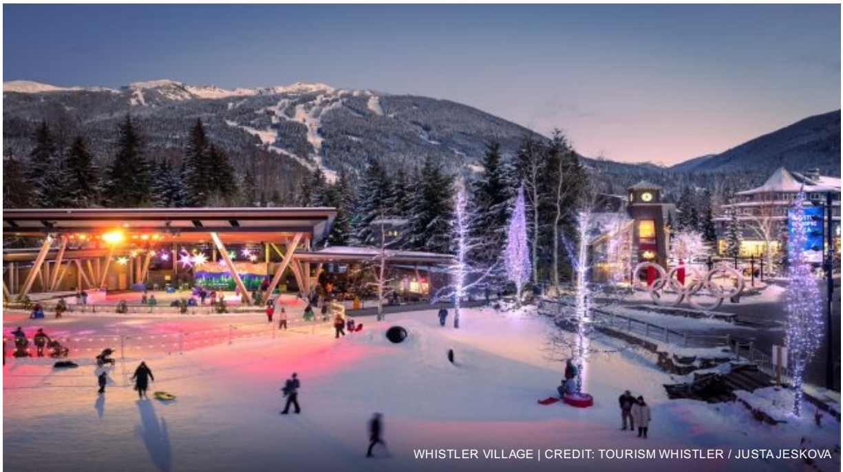
WHISTLER VILLAGE | CREDIT: TOURISM WHISTLER / JUSTA JESKOVA

Overnight in Whistler at Summit Lodge Boutique Hotel