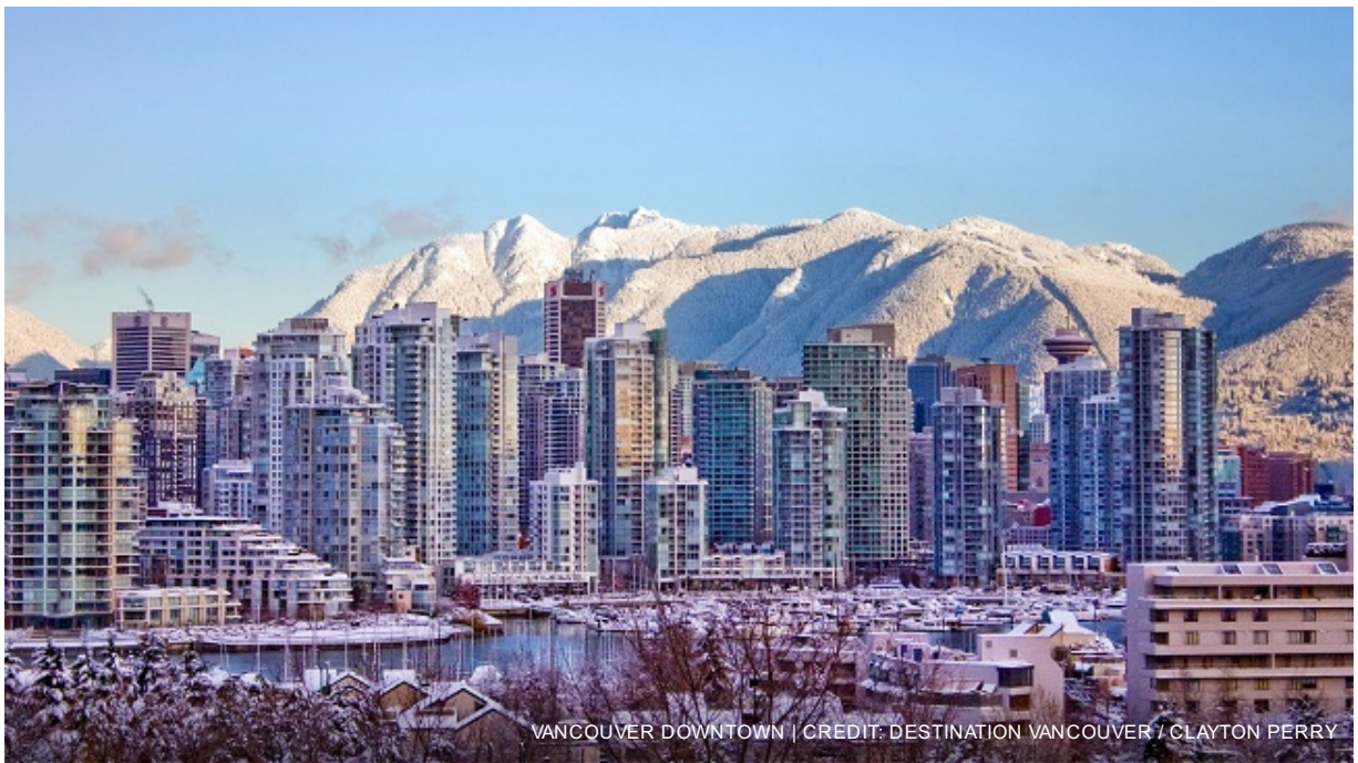
VANCOUVER DOWNTOWN