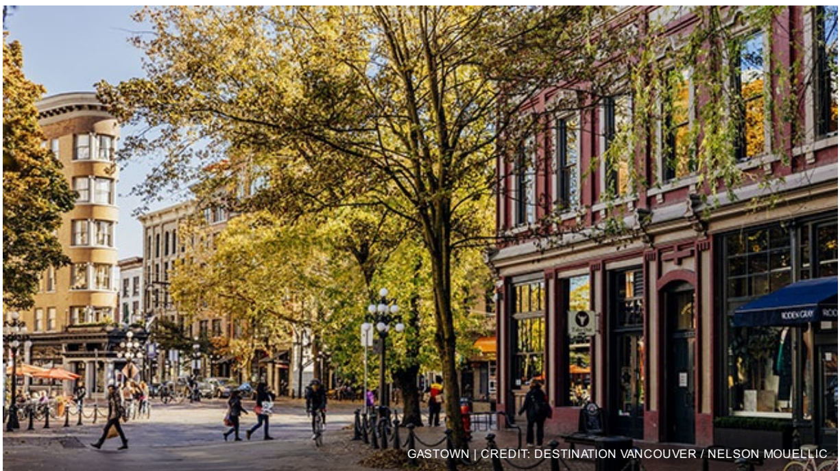
GASTOWN

Overnight in Vancouver at the Rosedale on Robson Suite Hotel