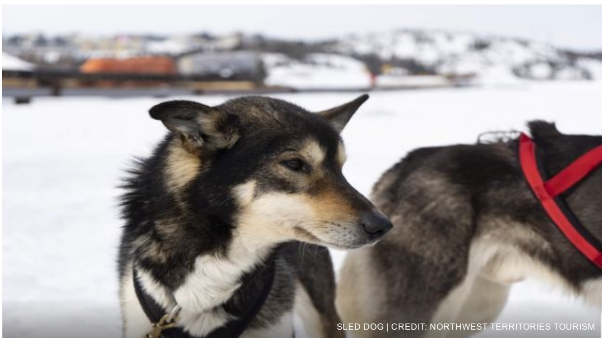
SLED DOG

Overnight stay in Yellowknife at The Explorer Hotel in a Superior Room.