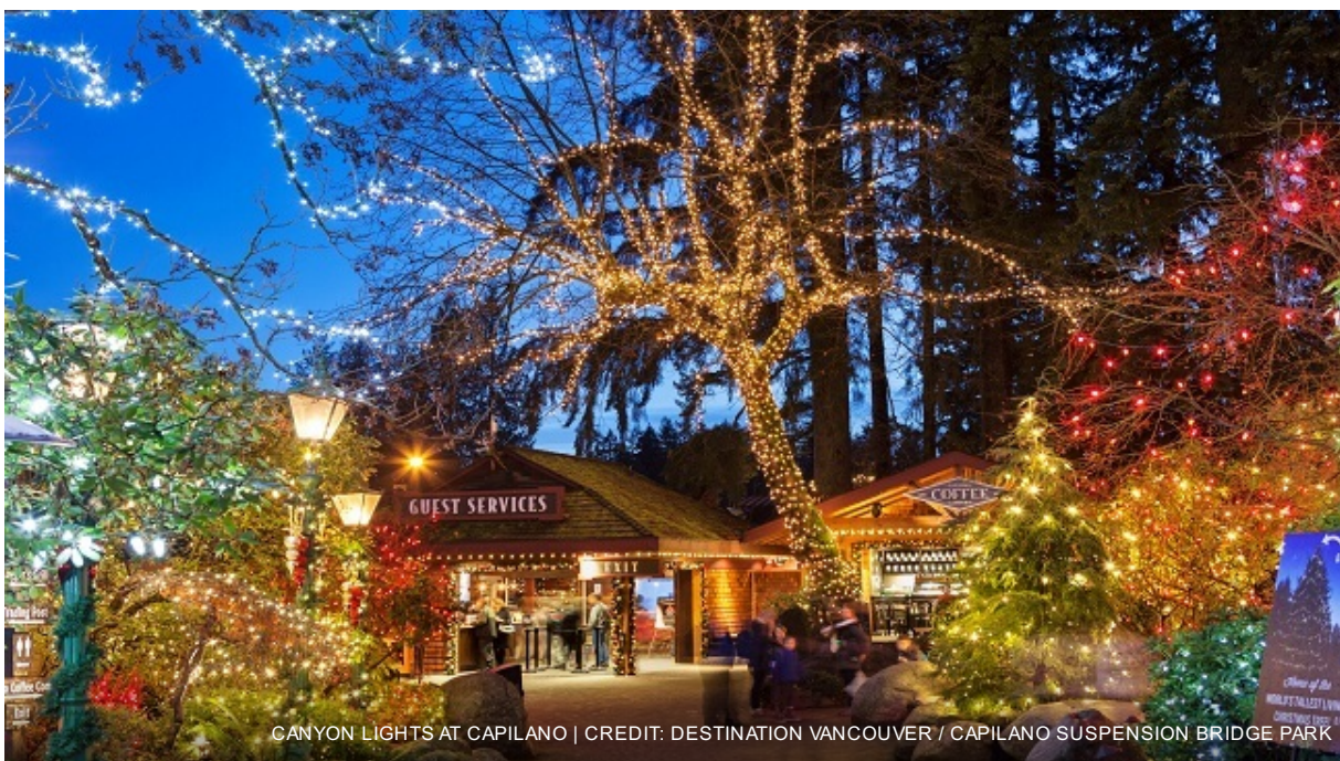
CANYON LIGHTS AT CAPILANO | CREDIT: DESTINATION VANCOUVER / CAPILANO SUSPENSION BRIDGE PARK

Overnight in Vancouver at the Sutton Place Hotel