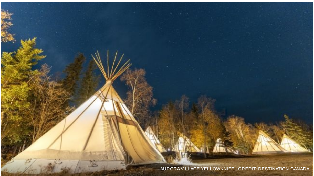
AURORA VILLAGE YELLOWKNIFE