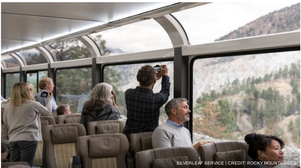
SILVERLEAF SERVICE | CREDIT: ROCKY MOUNTAINEER