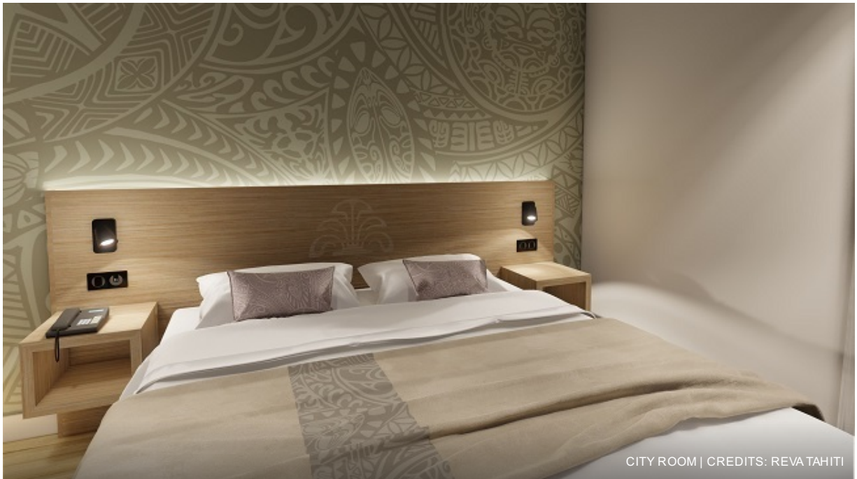
CITY ROOM | CREDITS: REVA TAHITI

Overnight stay in Tahiti at Reva Tahiti in a City Room.