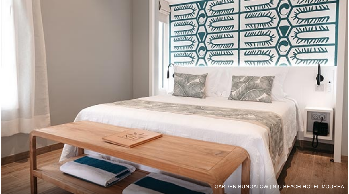
GARDEN BUNGALOW | NIU BEACH HOTEL MOOREA