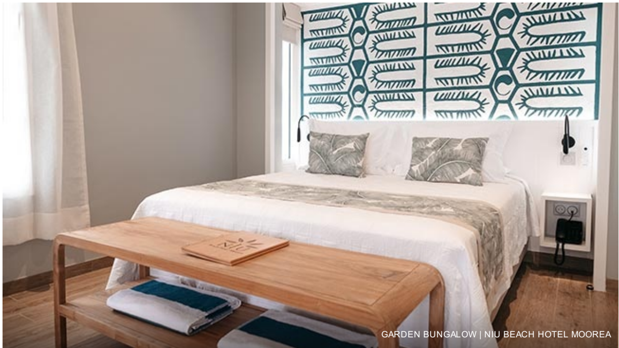
GARDEN BUNGALOW | NIU BEACH HOTEL MOOREA

Overnight stay in Moorea at Niu Beach Hotel Moorea in a Garden Bungalow & Kitchen.