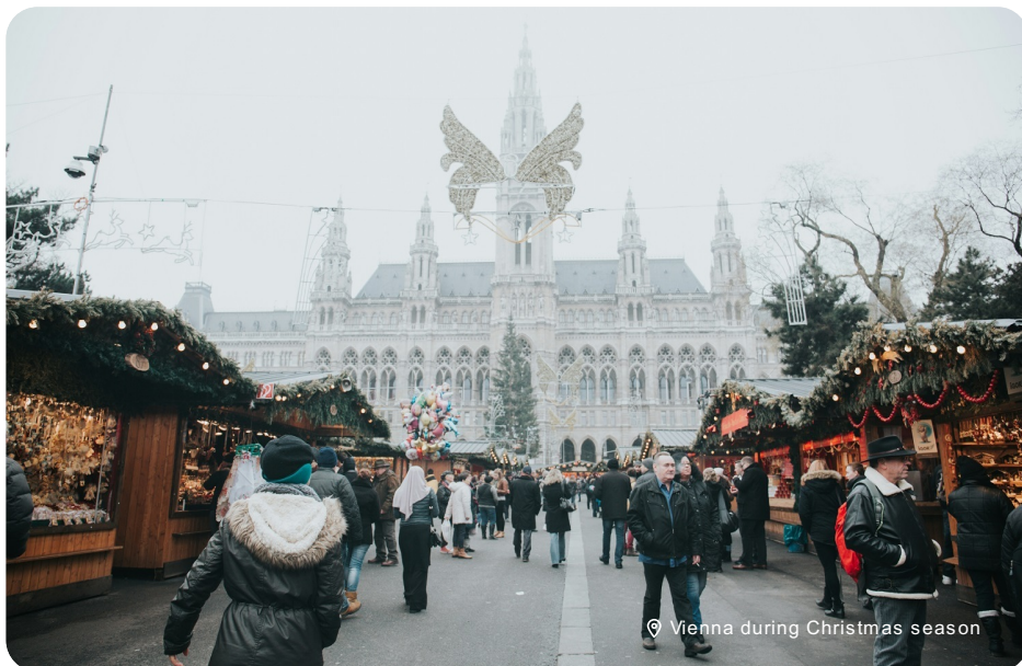
Vienna during Christmas season