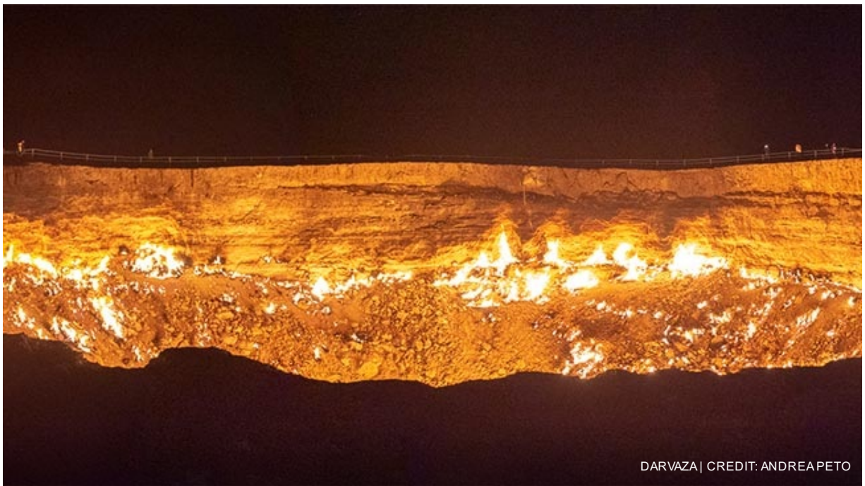
DARVAZA