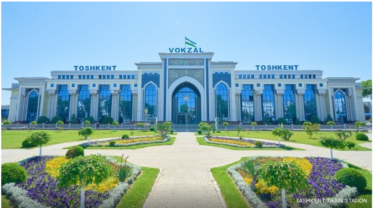
TASHKENT TRAIN STATION