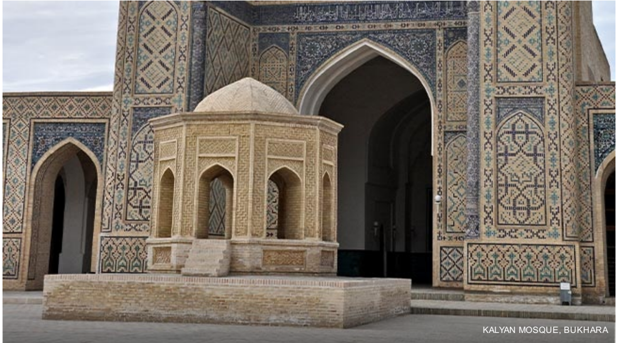
KALYAN MOSQUE, BUKHARA