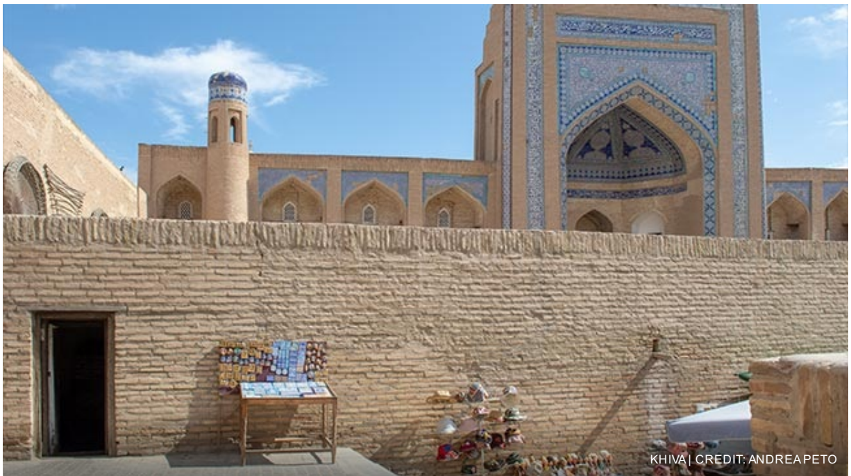
KHIVA