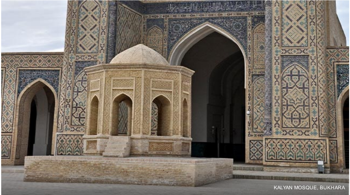
KALYAN MOSQUE, BUKHARA