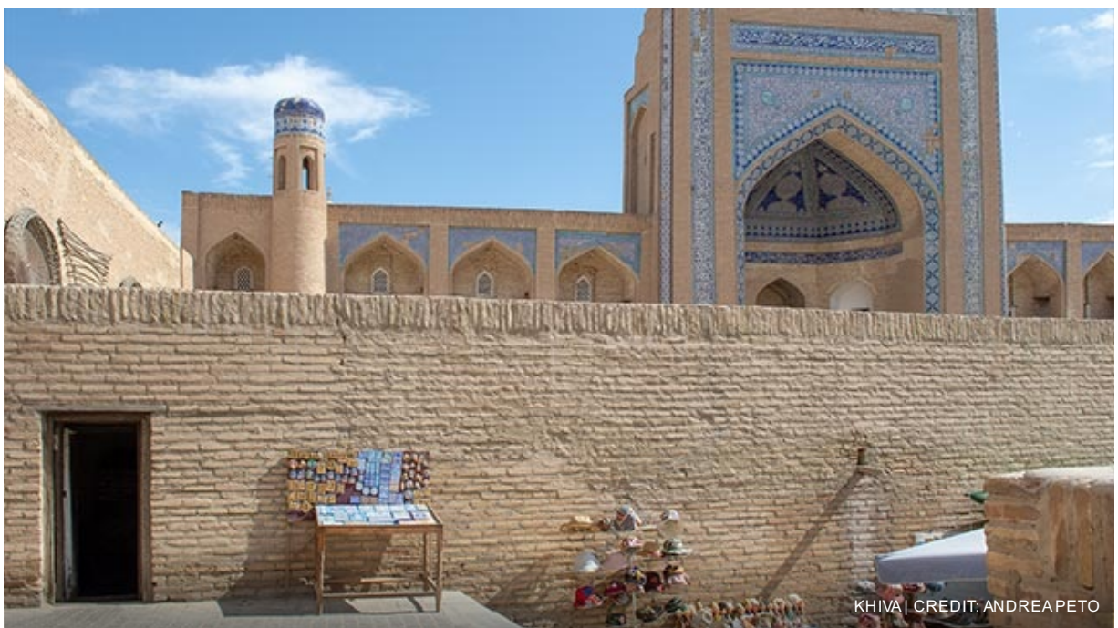
KHIVA