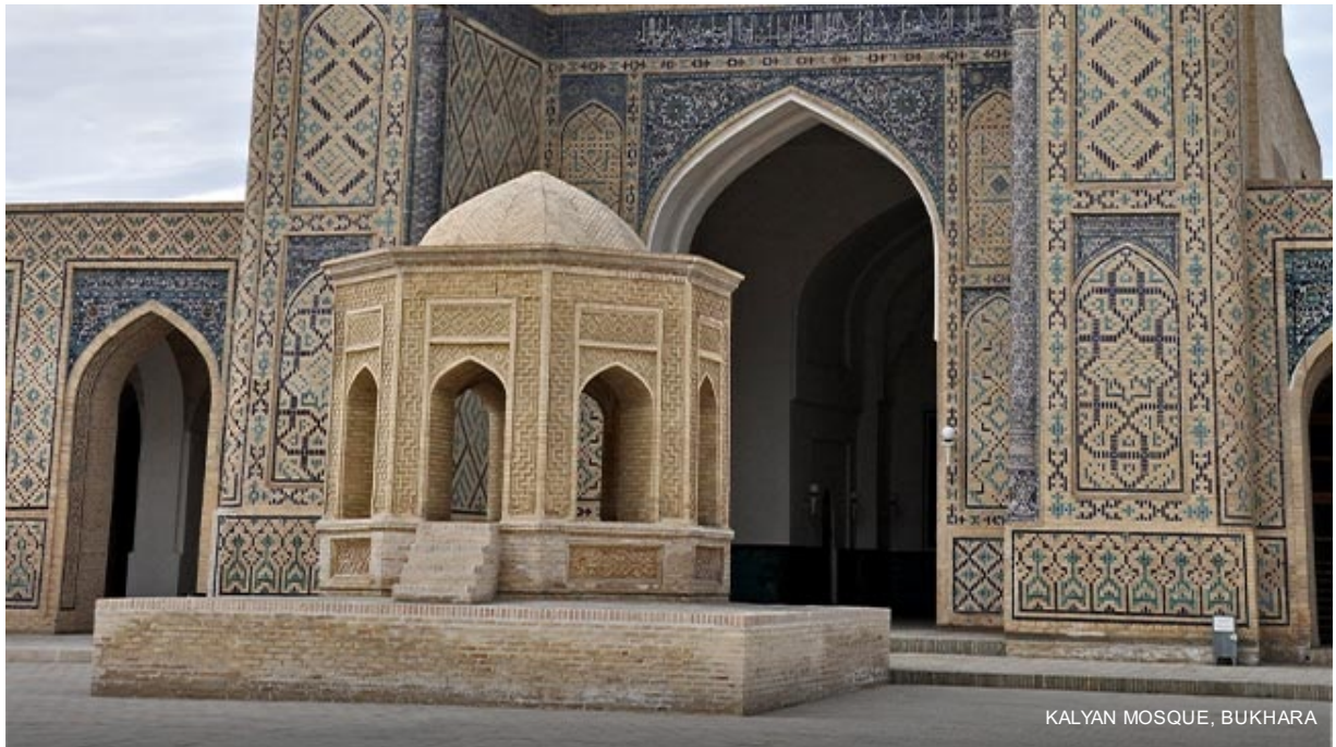
KALYAN MOSQUE, BUKHARA