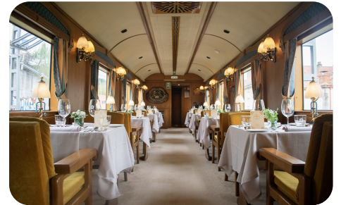
Costa Verde Express