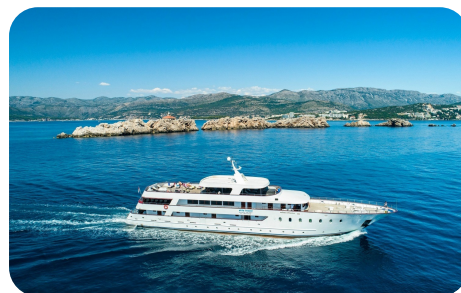
MS Adriatic Princess