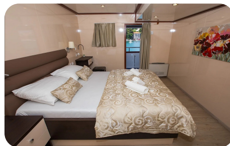
MS Adriatic Princess