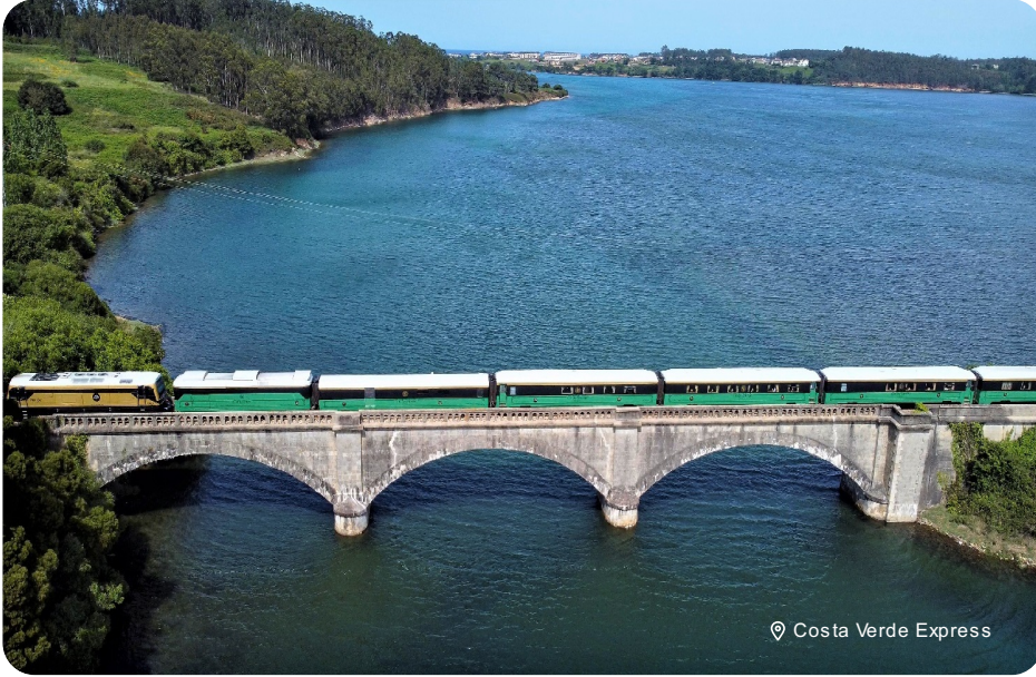
Costa Verde Express