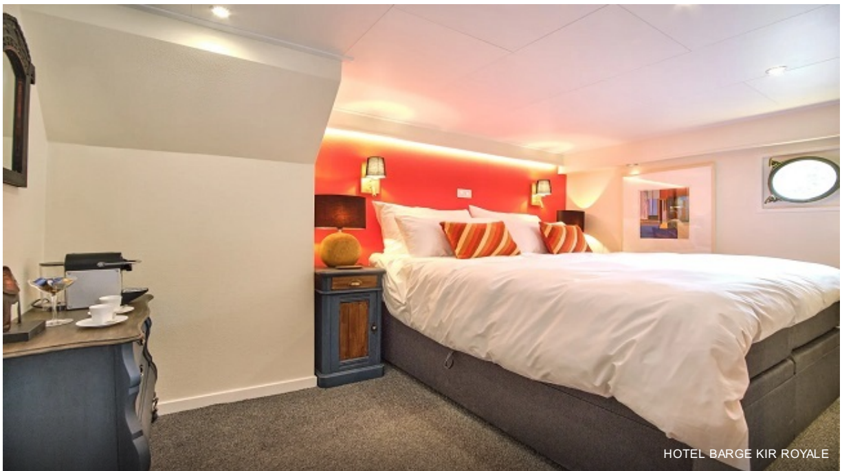
HOTEL BARGE KIR ROYALE