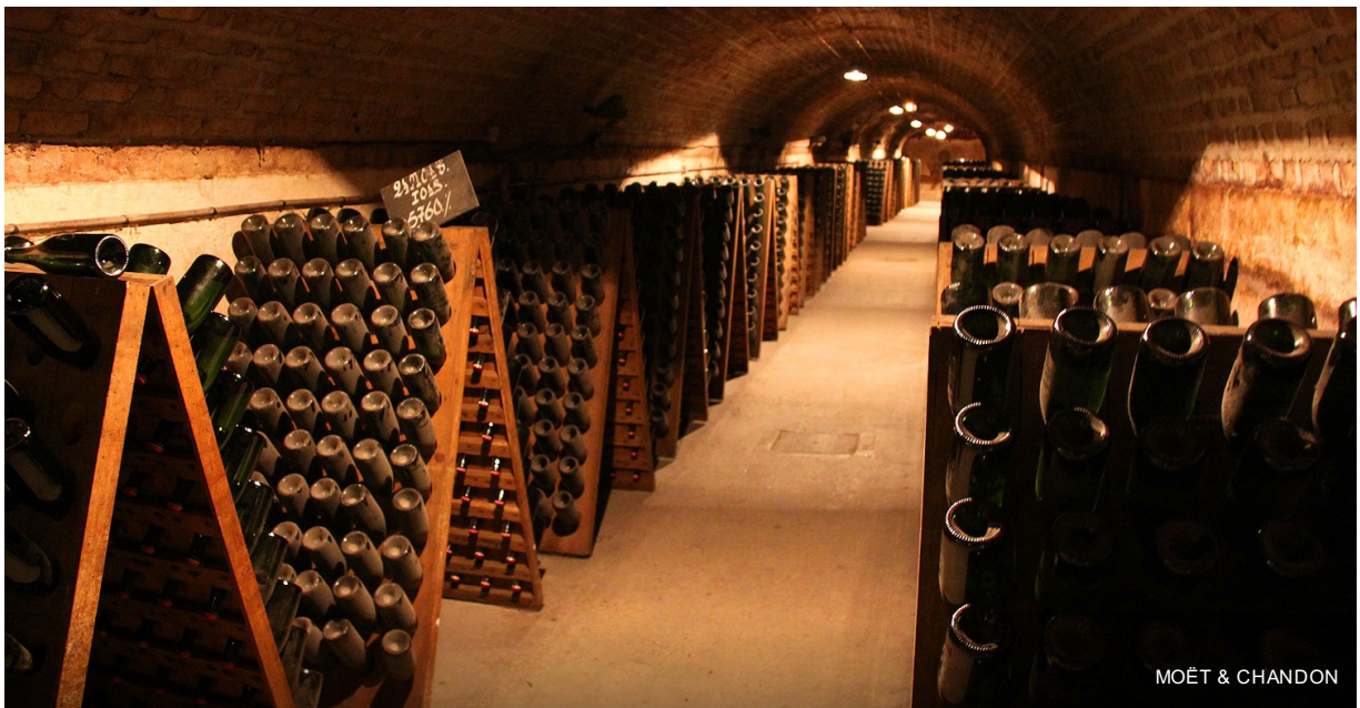
MOËT & CHANDON