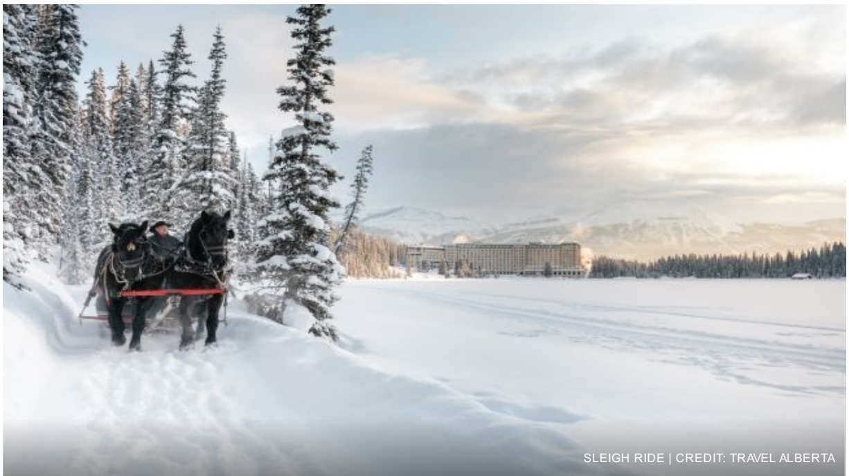
SLEIGH RIDE