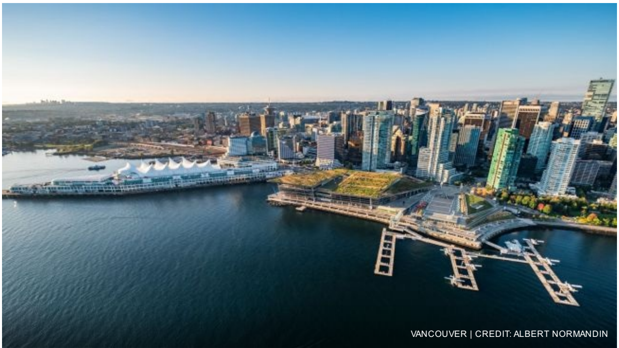
VANCOUVER