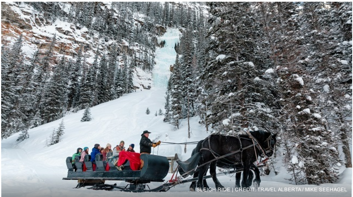
SLEIGH RIDE