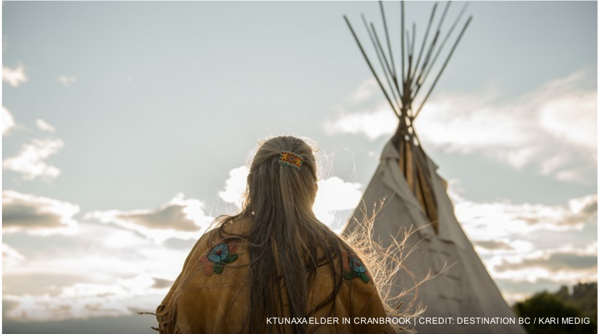
KTUNAXA ELDER IN CRANBROOK | CREDIT: DESTINATION BC / KARI MEDIG

Overnight in Nelson at Prestige Lakeside Resort