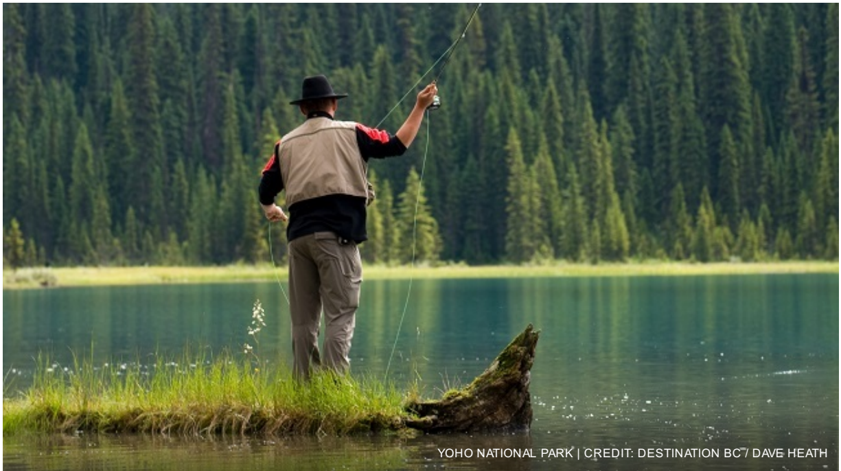
YHO NATIONAL PARK

Overnight in Field at Emerald Lake Lodge