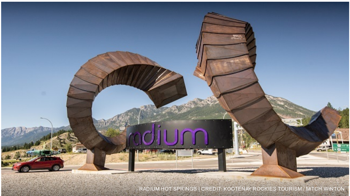
RADIUM HOT SPRINGS

Overnight in Radium Hot Springs at Prestige Radium Resort