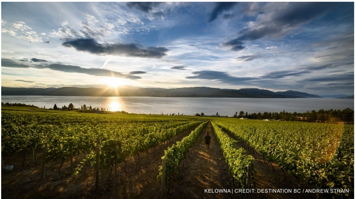
KELOWNA | CREDIT: DESTINATION BC / ANDREW STRAIN