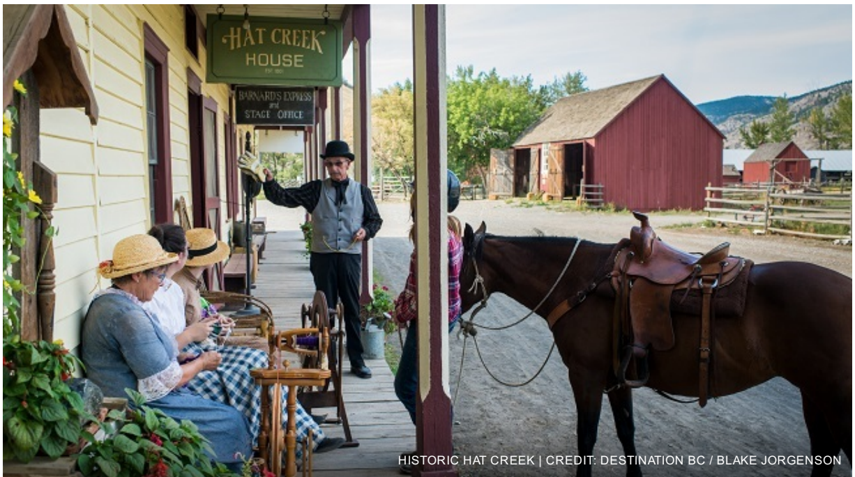
HISTORIC HAT CREEK

Overnight in Kelowna at Prestige Beach House