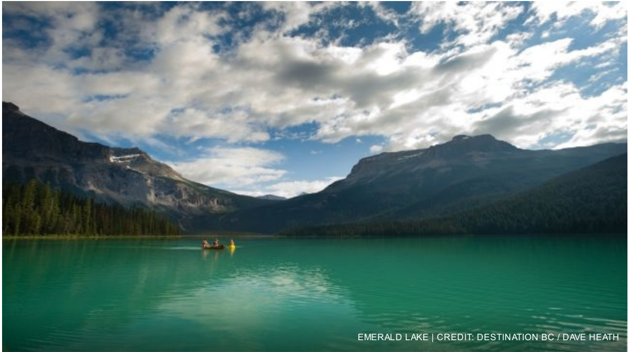
EMERALD LAKE