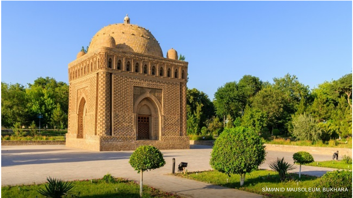
SAMANID MAUSOLEUM, BUKHARA