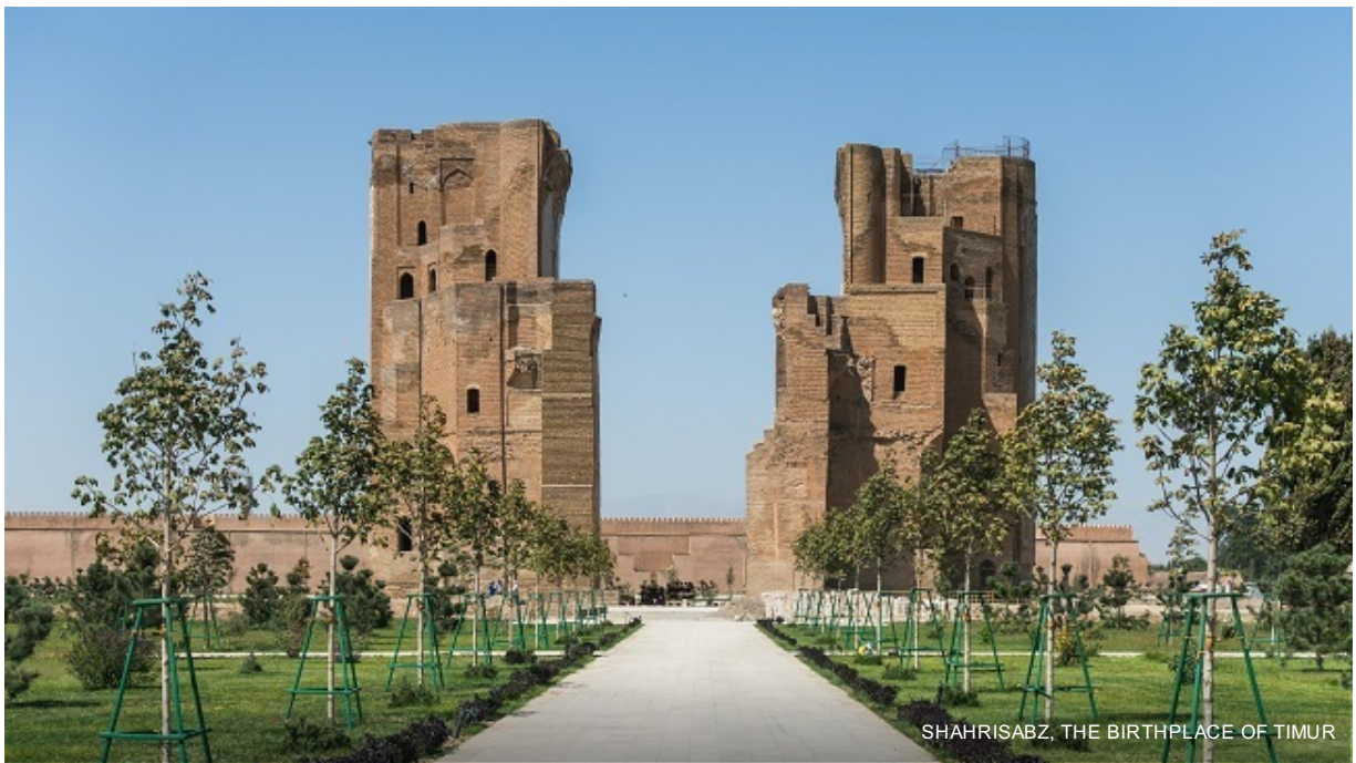
SHAHRISABZ, THE BIRTHPLACE OF TIMUR