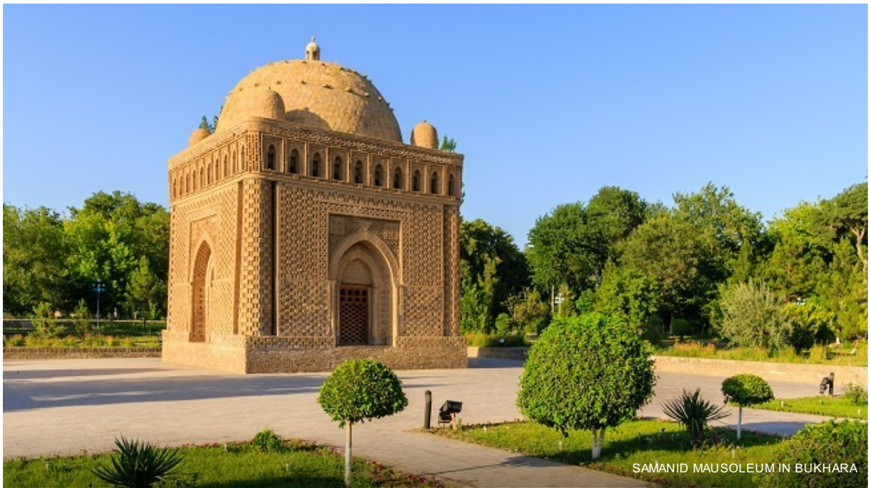
SAMANID MAUSOLEUM IN BUKHARA