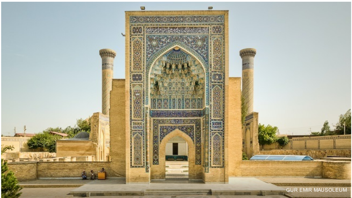
GUR EMIR MAUSOLEUM