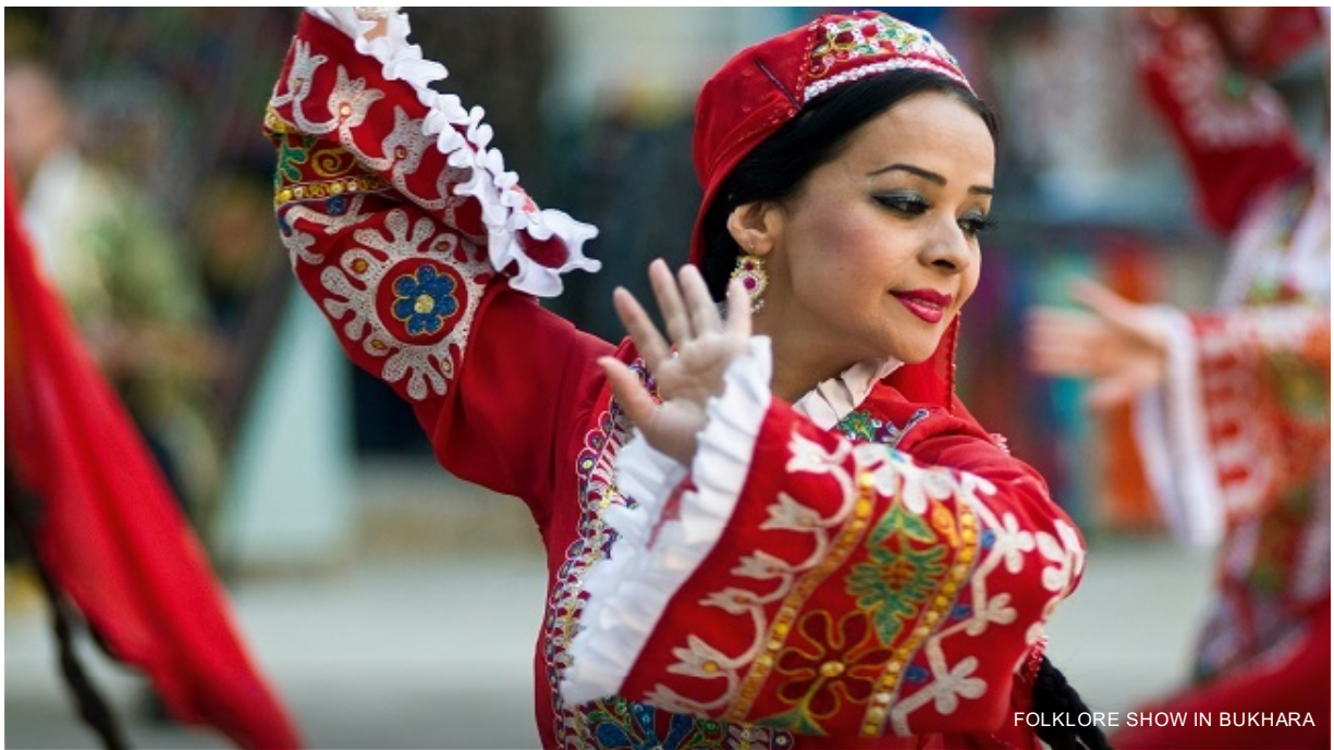
FOLKLORE SHOW IN BUKHARA