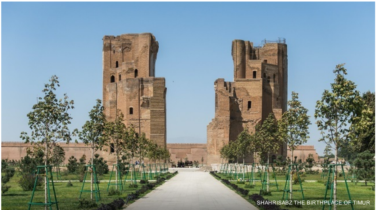
SHAHRISSABZ THE BIRTHPLACE OF TIMUR