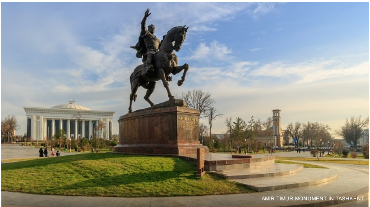
AMIR TIMUR MONUMENT IN TASHKENT