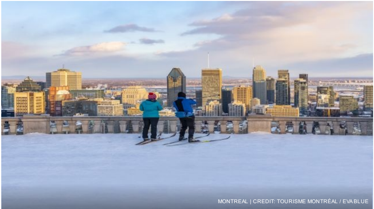
MONTREAL

Overnight in Montreal at the Fairmont Queen Elizabeth