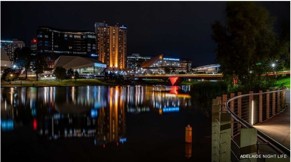
ADELAIDE NIGHT LIFE