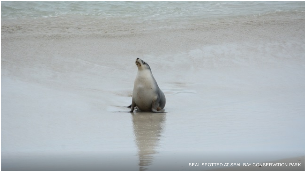
SEAL SPOTTED AT SEAL BAY CONSERVATION PARK