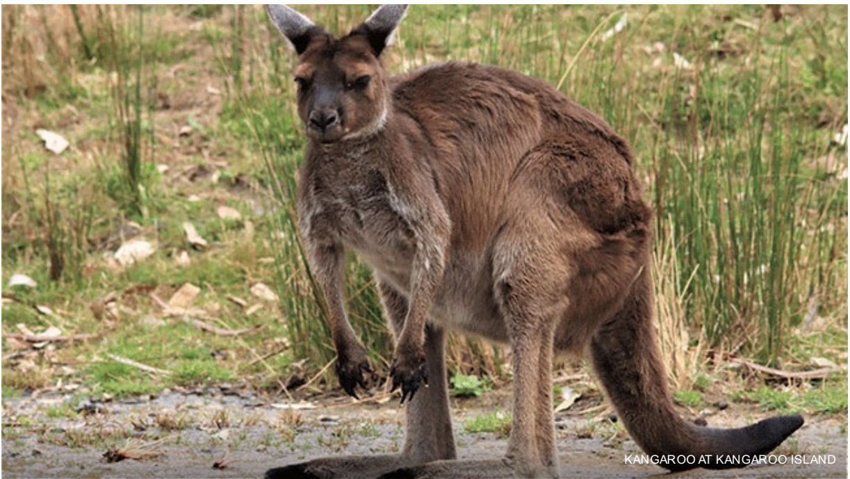
KANGAROO AT KANGAROO ISLAND