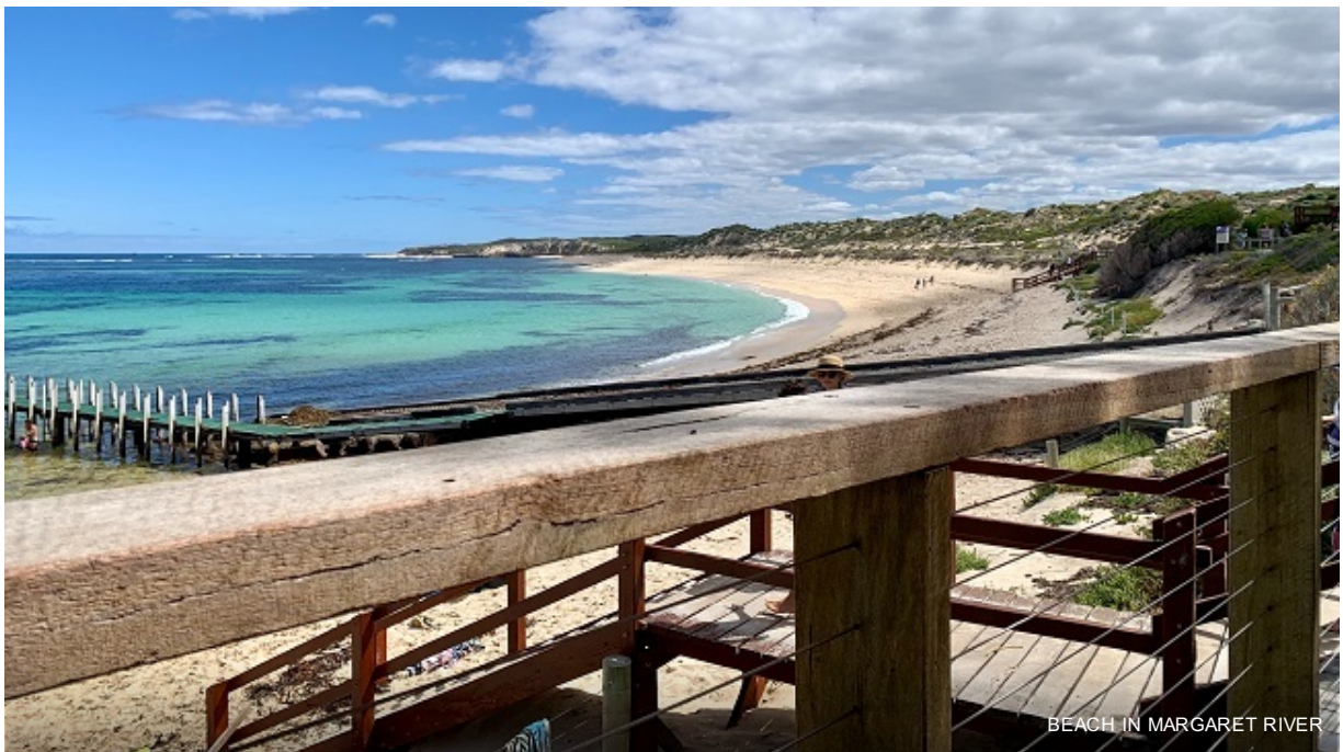
BEACH IN MARGARET RIVER