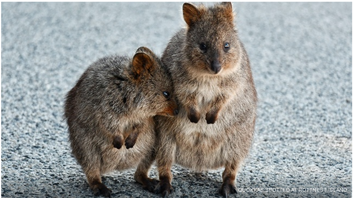
QUOKKAS SPOTTED AT ROTTNEST ISLAND