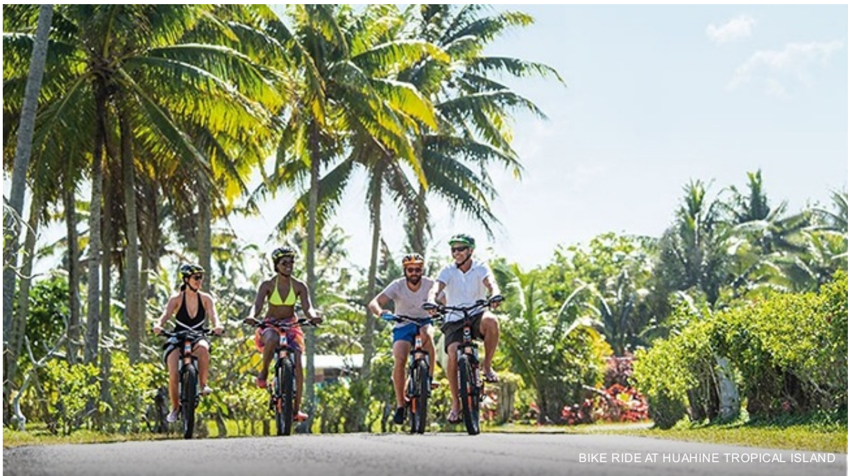
BIKE RIDE AT HUAHINE TROPICAL ISLAND