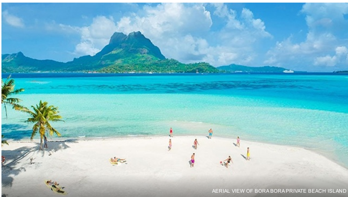
AERIAL VIEW OF BORABORA PRIVATE BEACH ISLAND