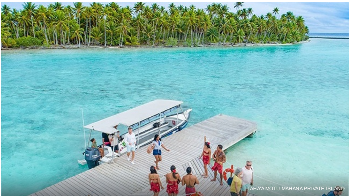
TAHA'A MOTU MAHANA PRIVATE ISLAND