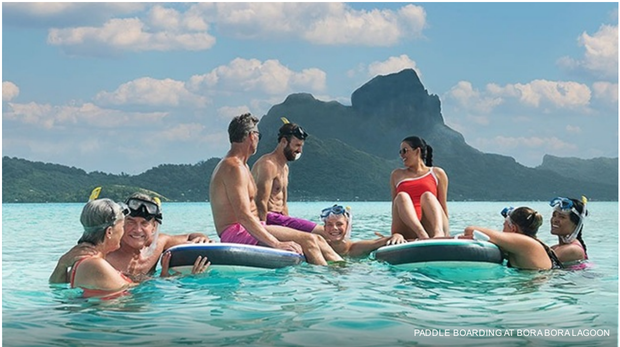
PADDLE BOARDING AT BORA BORA LAGOON