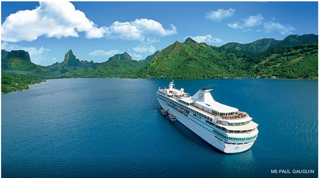
MS PAUL GAUGUIN