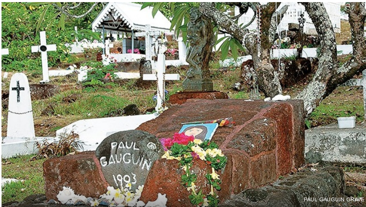
PAUL GAUGUIN GRAVE