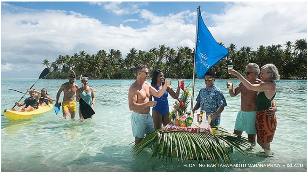
FLOATING BAR TAHAA MŌTU MAHĀNA PRIVATE ISLAND