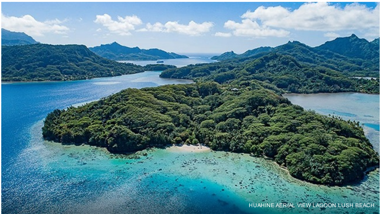
HUAHINE AERIAL VIEW LAGOON LUSH BEACH