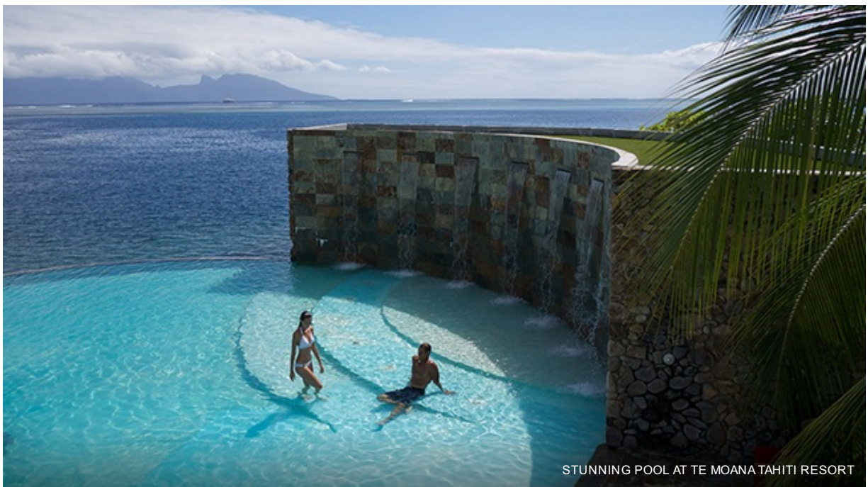
STUNNING POOL AT TE MOANA TAHITI RESORT

Overnight stay in Tahiti at Te Moana Tahiti