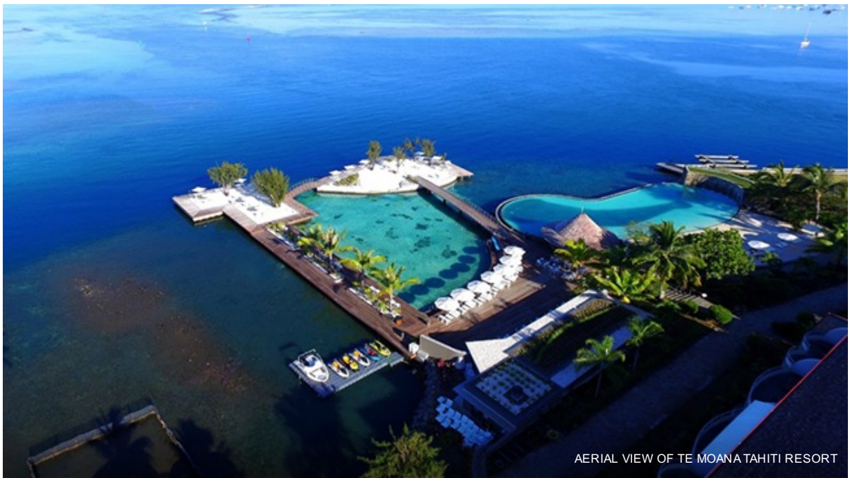
AERIAL VIEW OF TE MOANA TAHITI RESORT