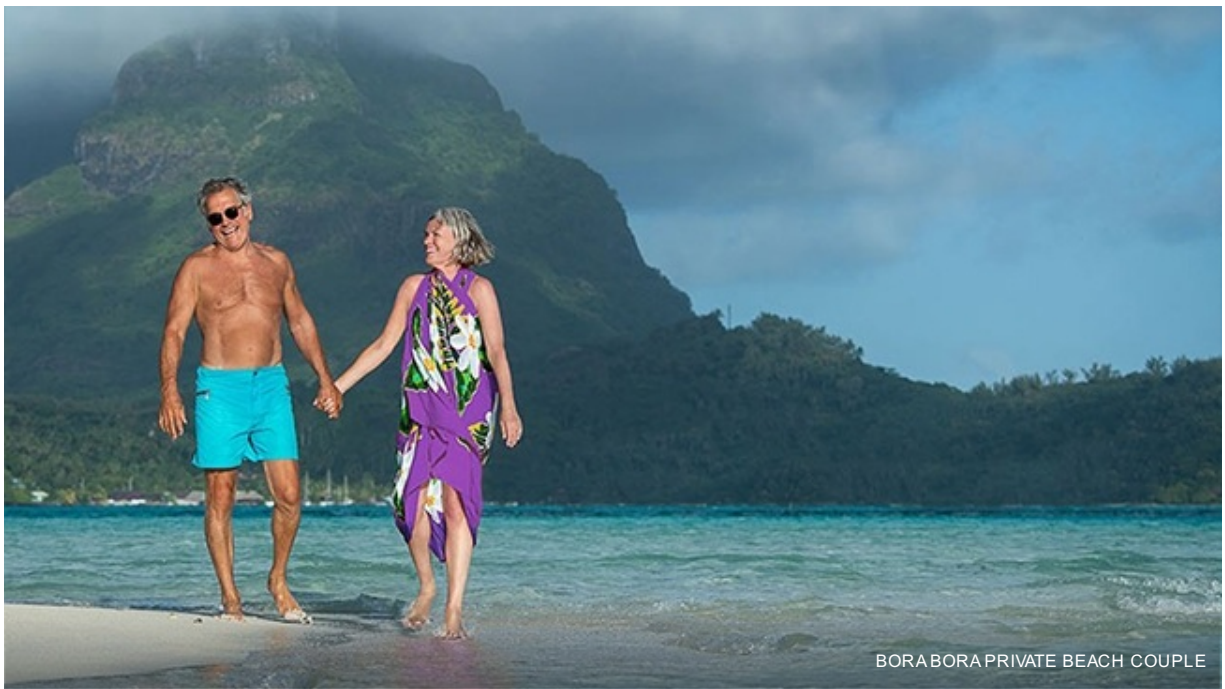
BORA BORA PRIVATE BEACH COUPLE