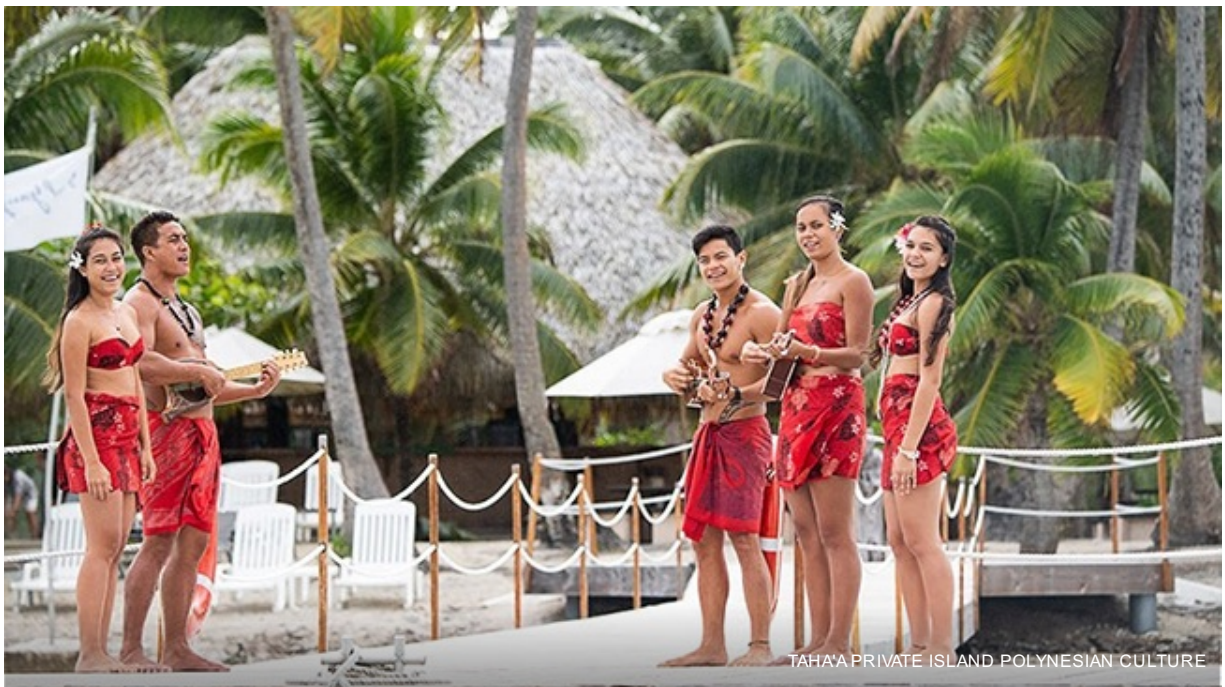
TAHA'A PRIVATE ISLAND POLYNESIAN CULTURE