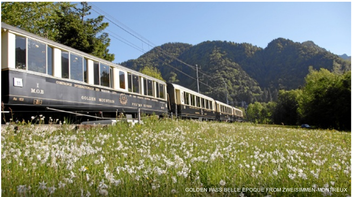
GOLDEN PASS BELLE EPOQUE FROM ZWEISIMMEN-MONTREUX