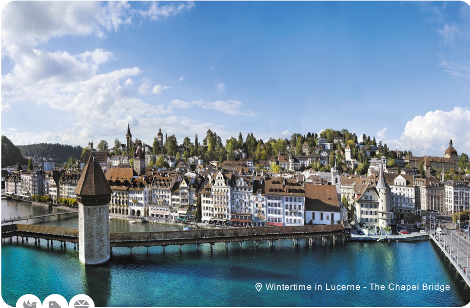
Wintertime in Lucerne - The Chapel Bridge