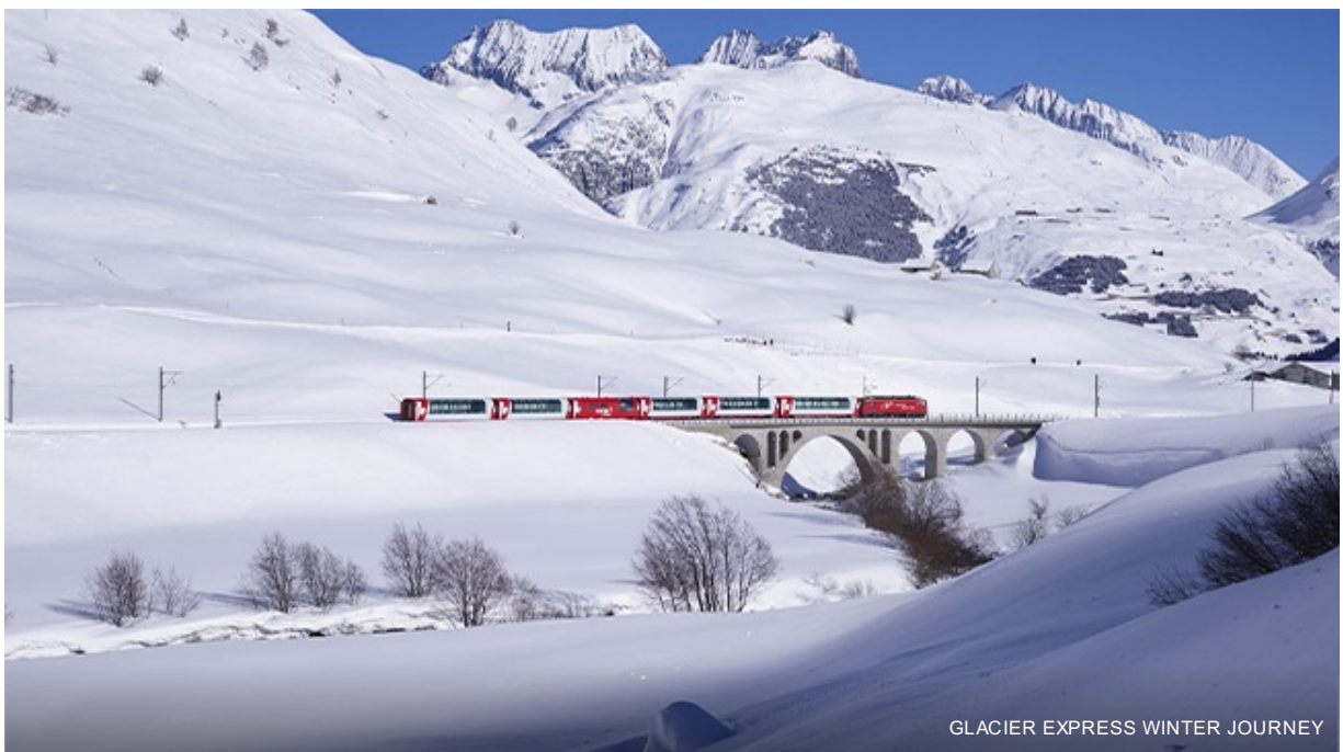
GLACIER EXPRESS WINTER JOURNEY