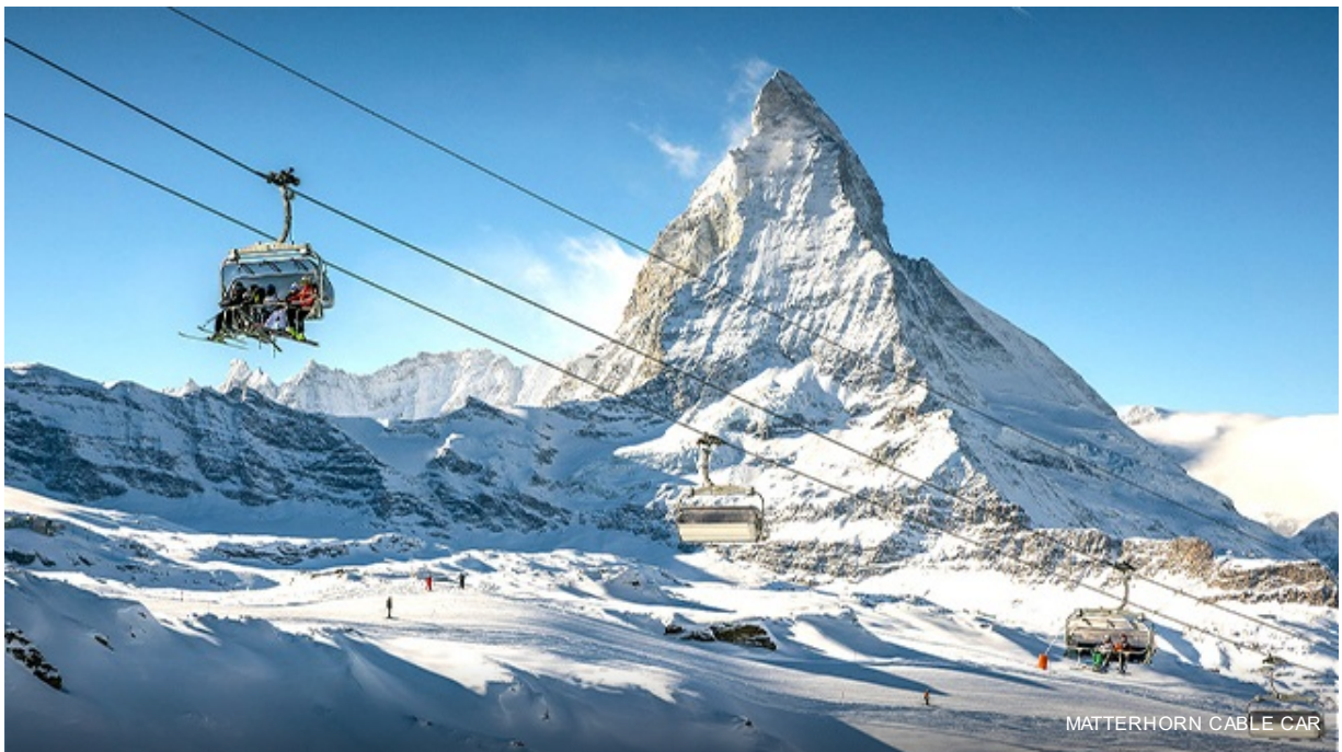
MATTERHORN CABLE CAR