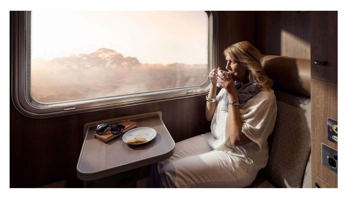
Prices are dynamic based on travel dates. Please proceed to Book Now or Contact Us for details.