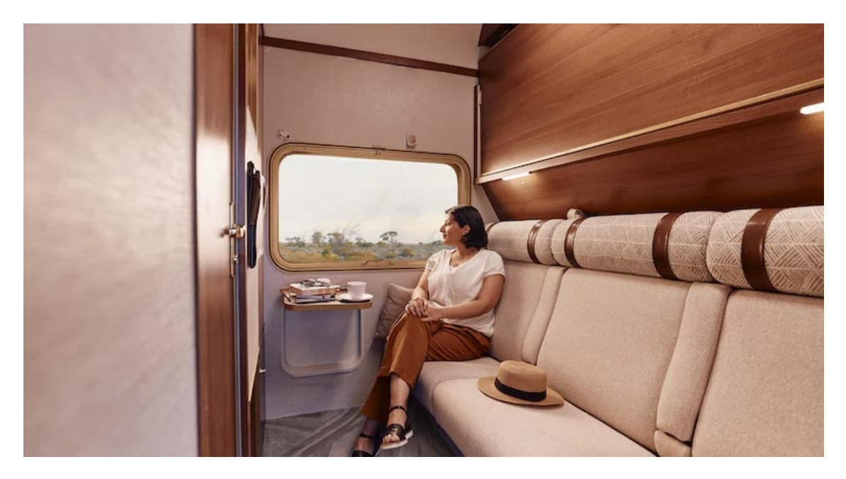
Prices are dynamic based on travel dates. Please proceed to Book Now or Contact Us for details.