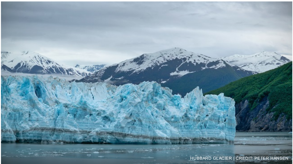
HUBBARD GLACIER