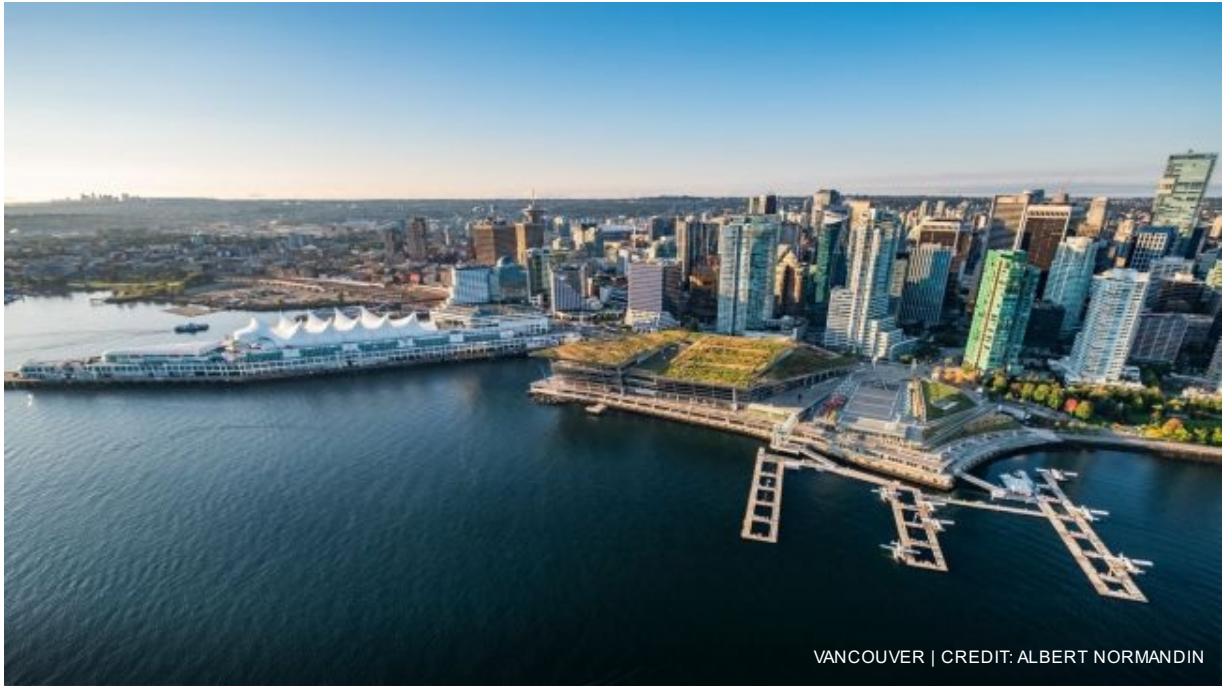
VANCOUVER