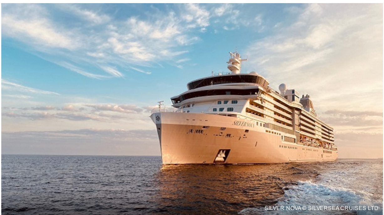
SILVER NOVA