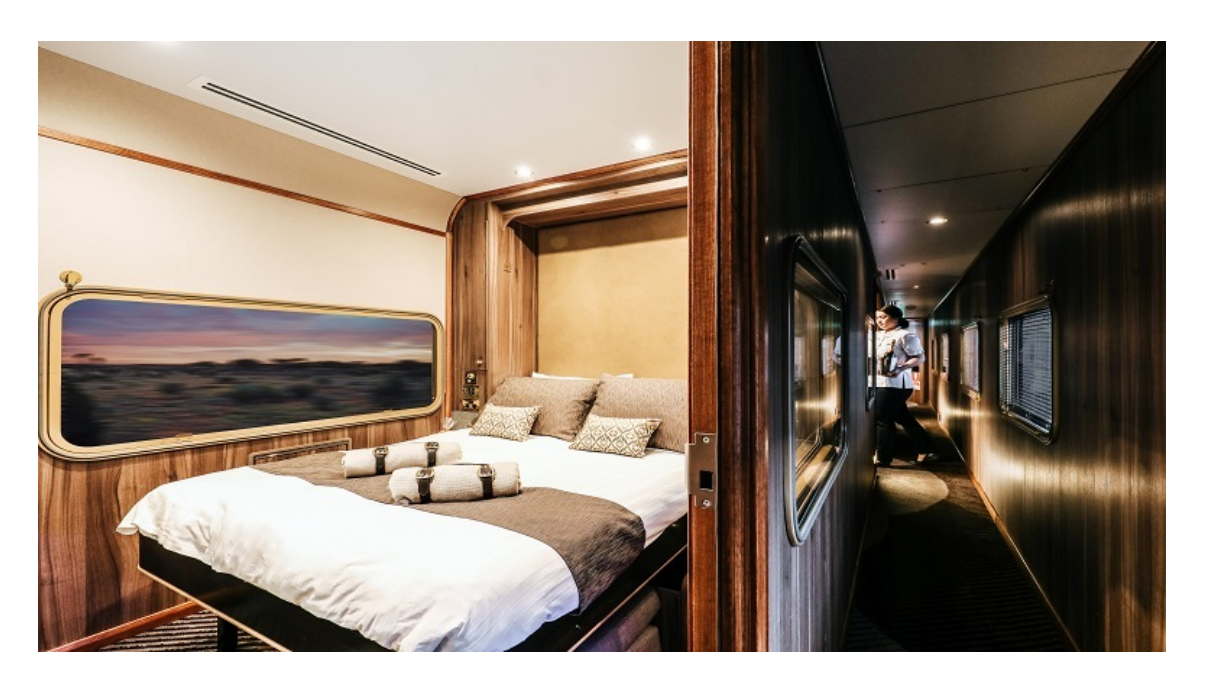
Prices are dynamic based on travel dates. Please proceed to Book Now or Contact Us for details.